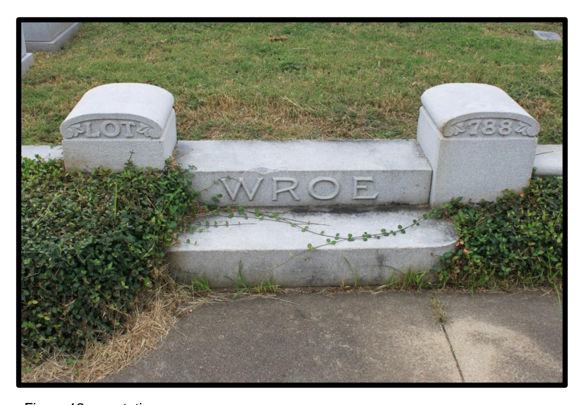
Figure 12: vegetation