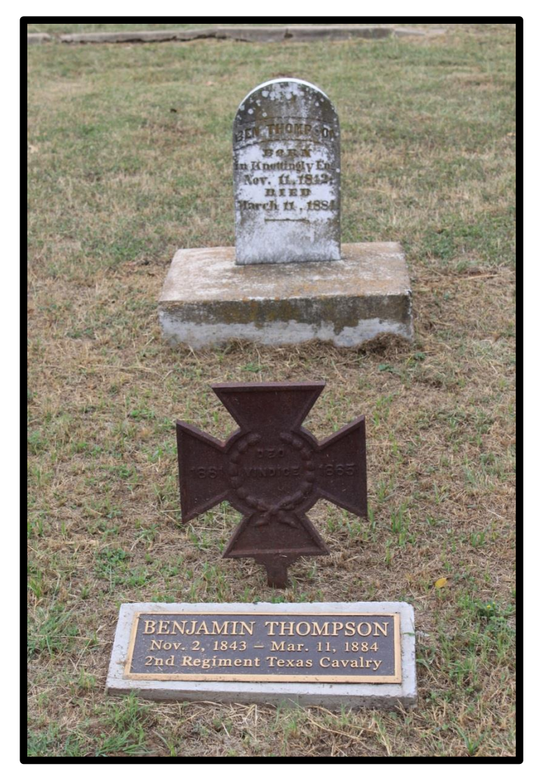
Figure 6: headstone, footstone, grave, symbol