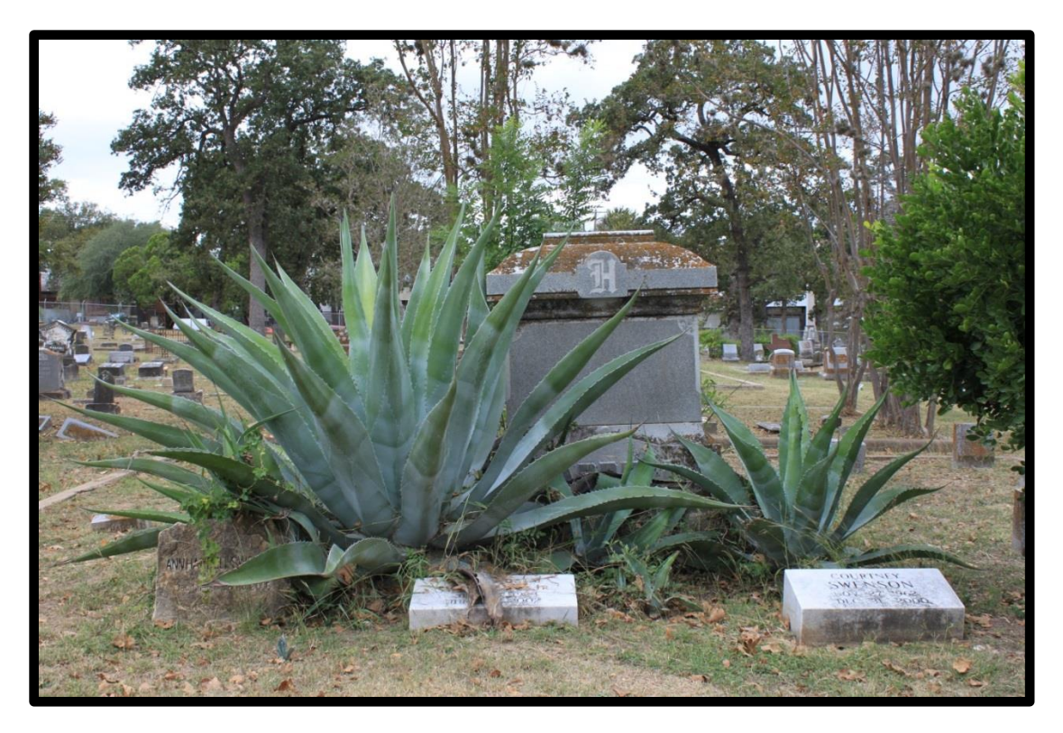
Figure 13: vegetation, monument, headstone