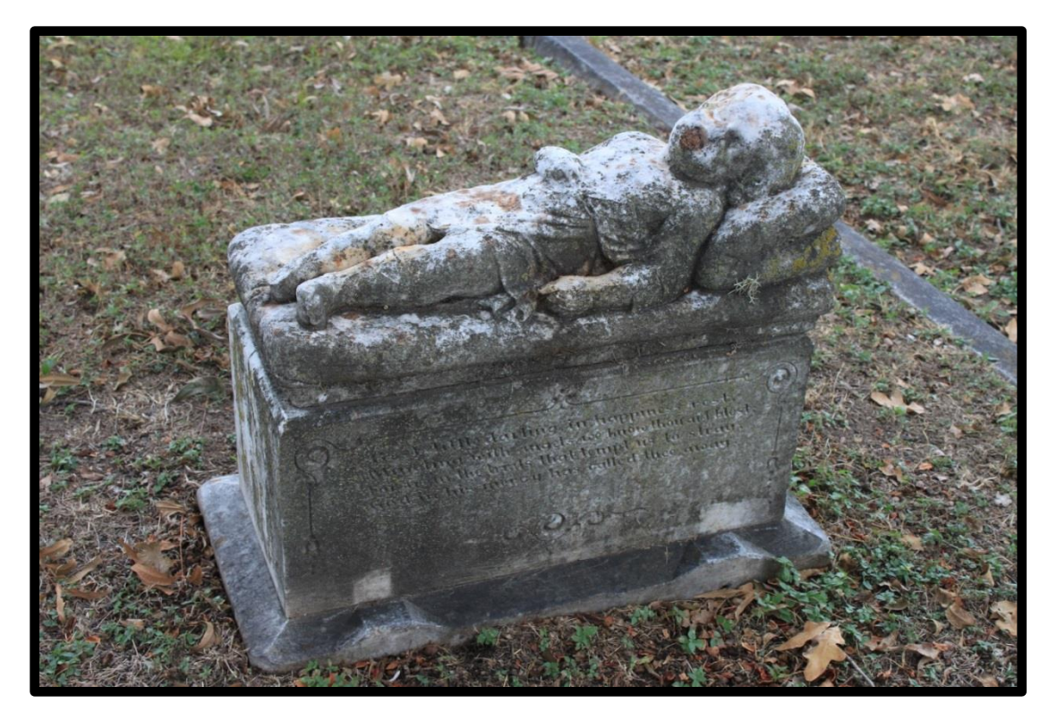
Figure 7: grave, symbol, epitaph