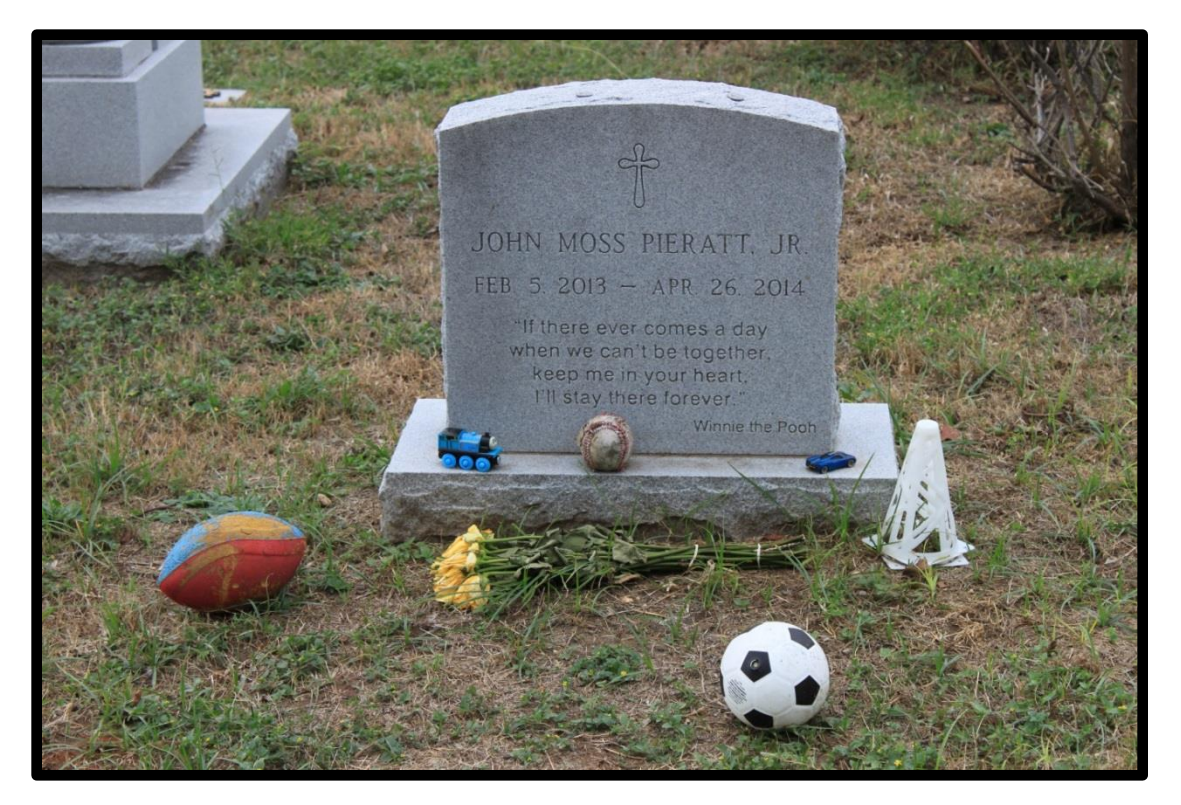
Figure 9: headstone, grave, symbol, epitaph