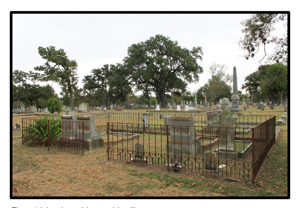
Figure 14: headstone(s), grave(s), railing