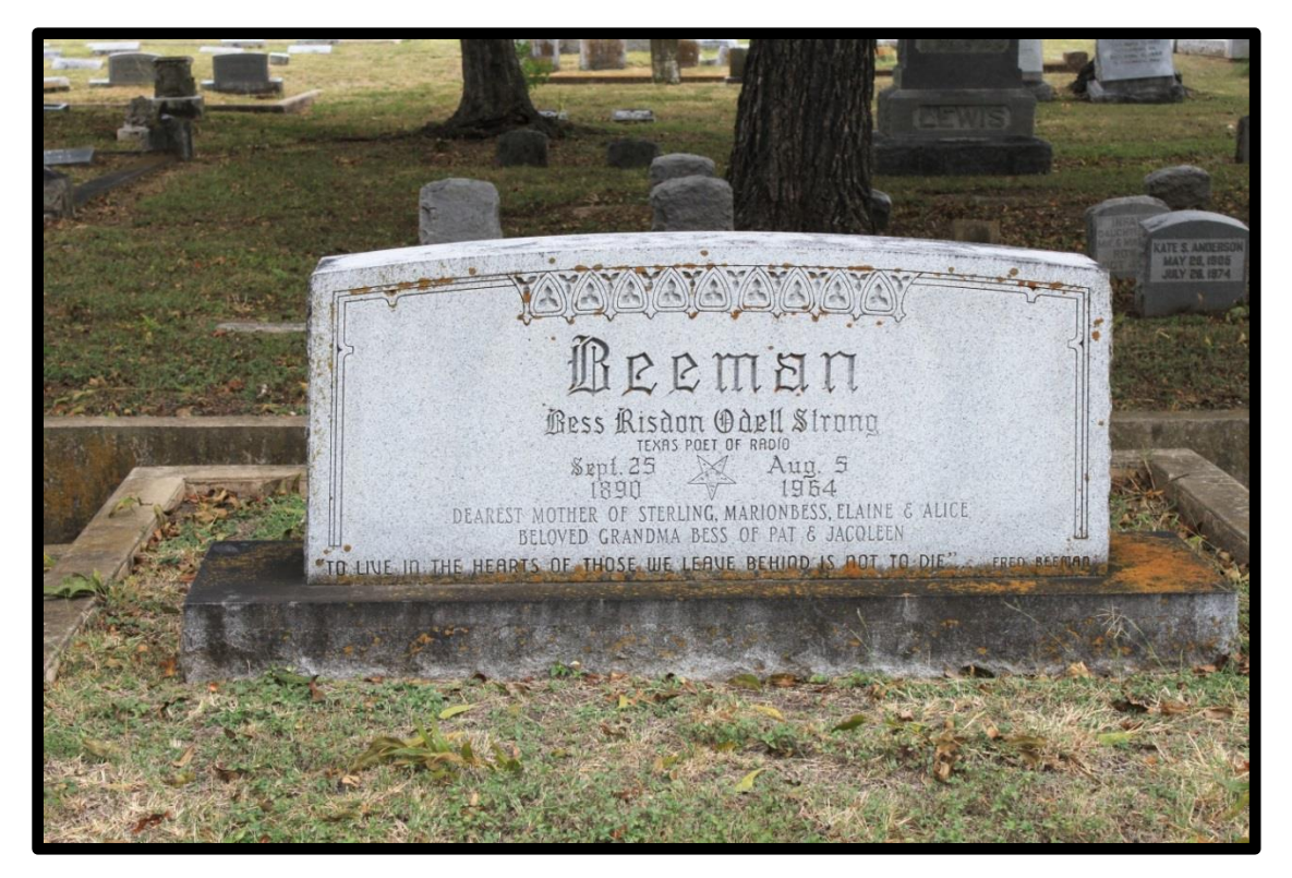
Figure 4: headstone, grave, epitaph,