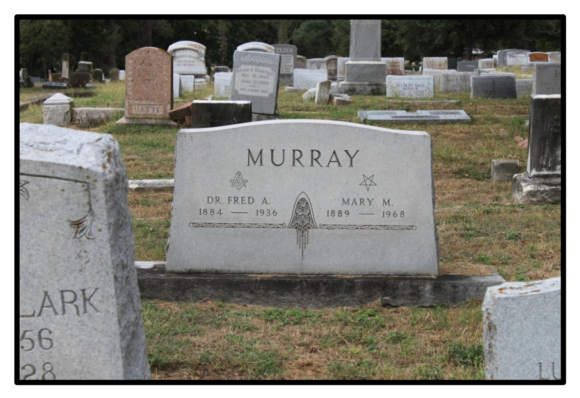
Figure 2: headstone, grave, symbol