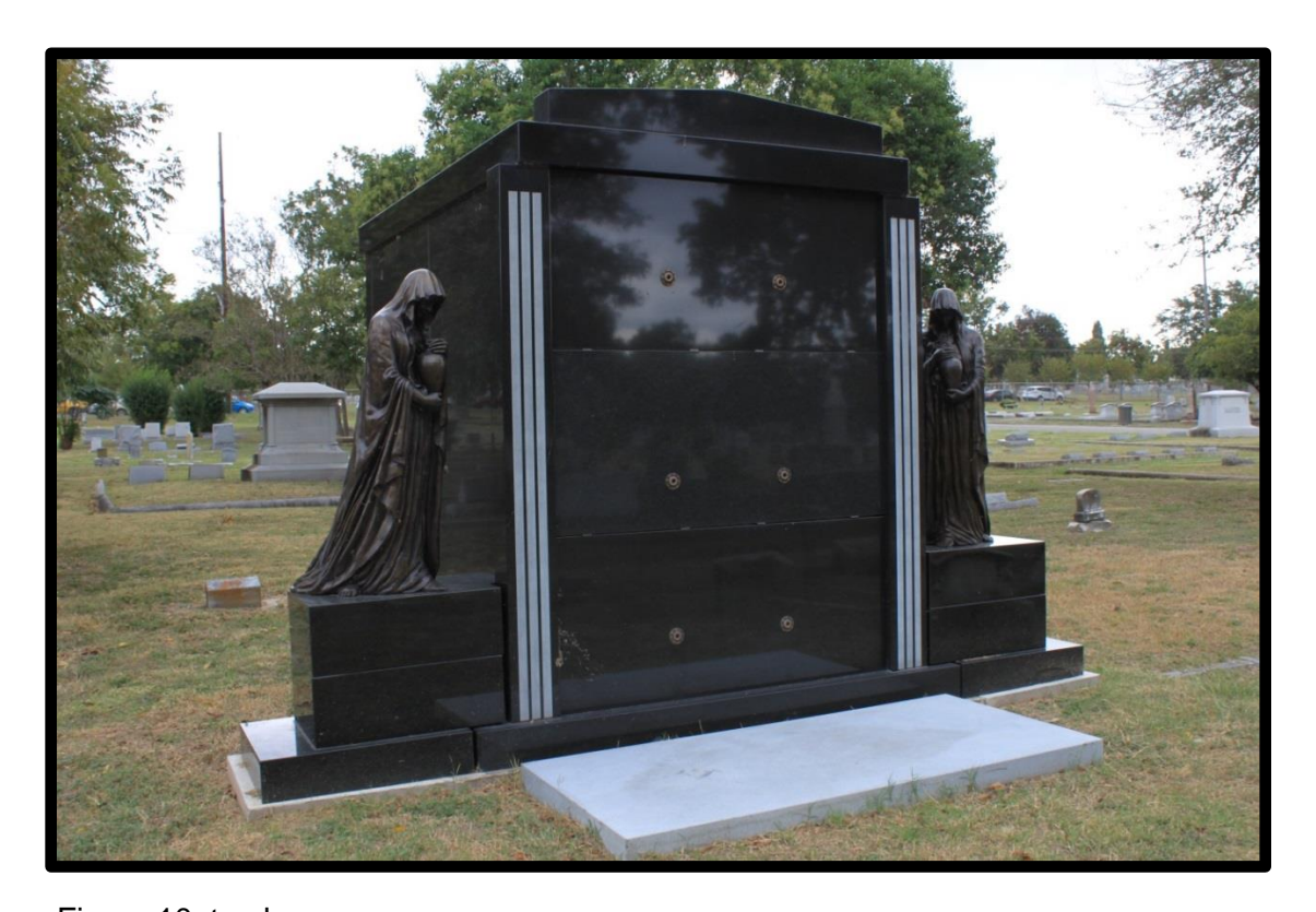
Figure 10: tomb, grave