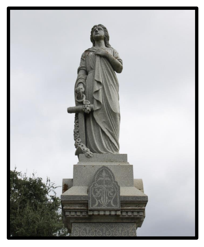
Figure 15: monument, symbol