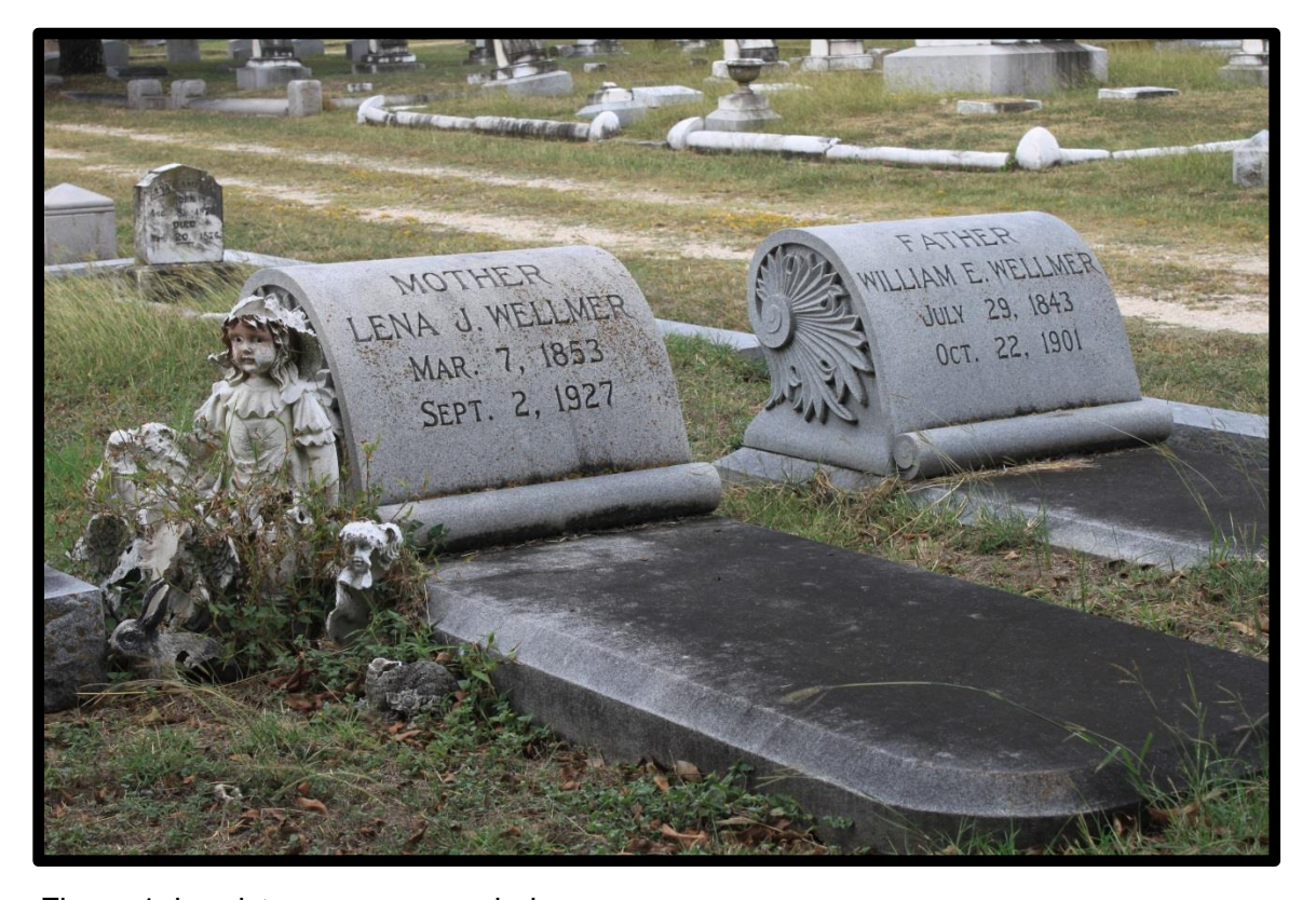
Figure 1: headstone, grave, symbol

Note: Below each figure are the vocabulary words associated with the image. These terms may be included in the gallery walk or deleted to encourage student discovery.