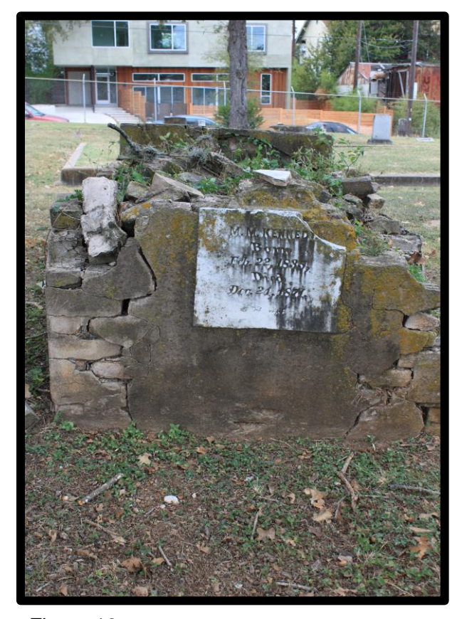
Figure 16: grave