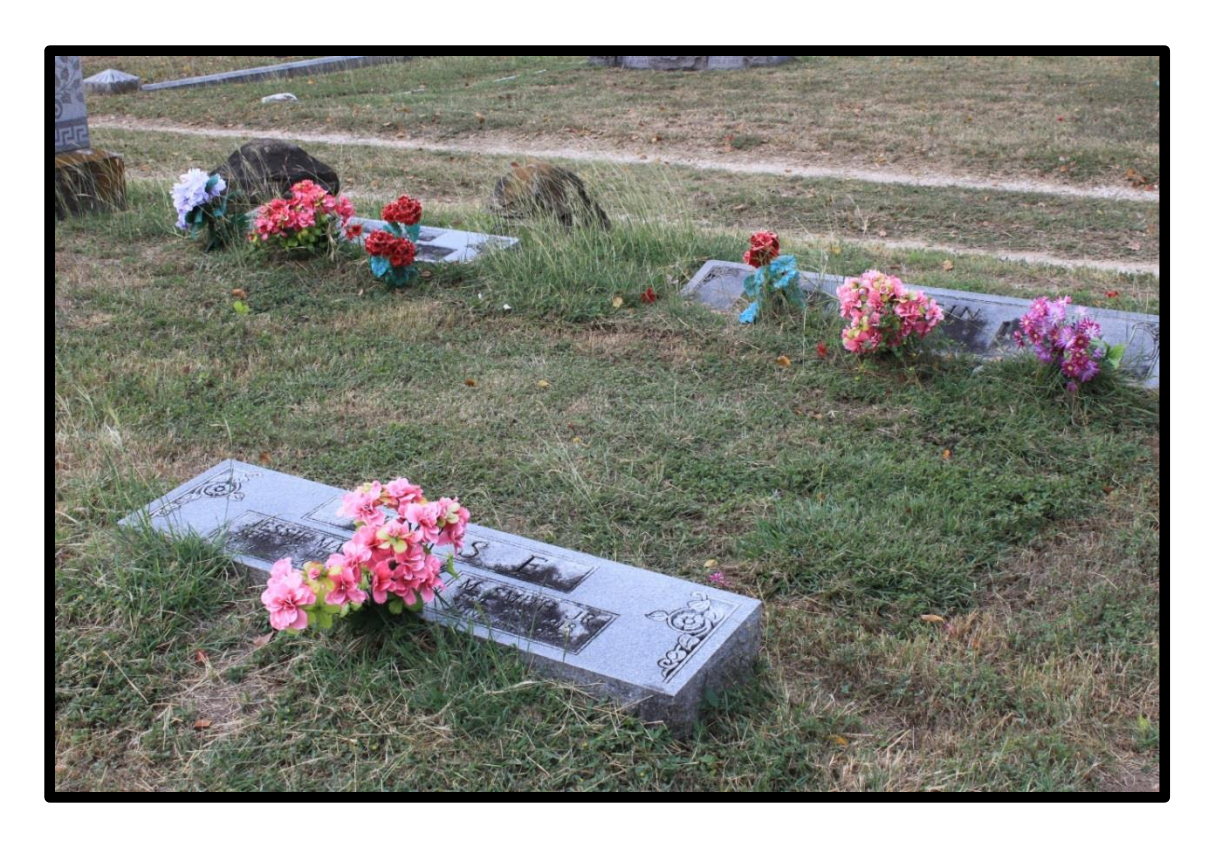
Figure 11: grave, vegetation