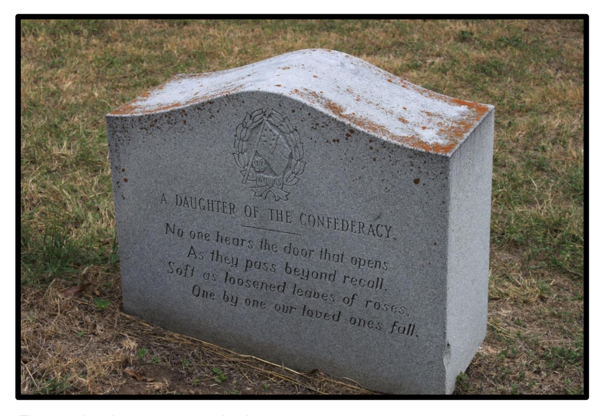
Figure 3: headstone, grave, epitaph