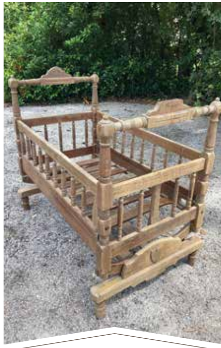
EASTLAKE CRADLE, LATE 19TH CENTURY, FULTON MANSION