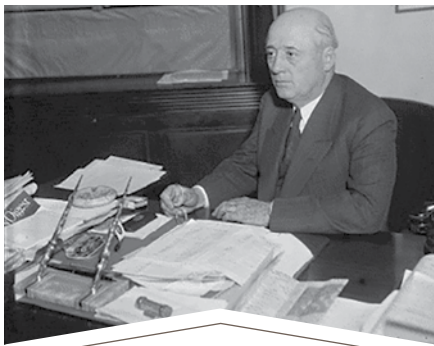
SAM RAYBURN'S CONGRESSIONAL DESK, SAM RAYBURN HOUSE