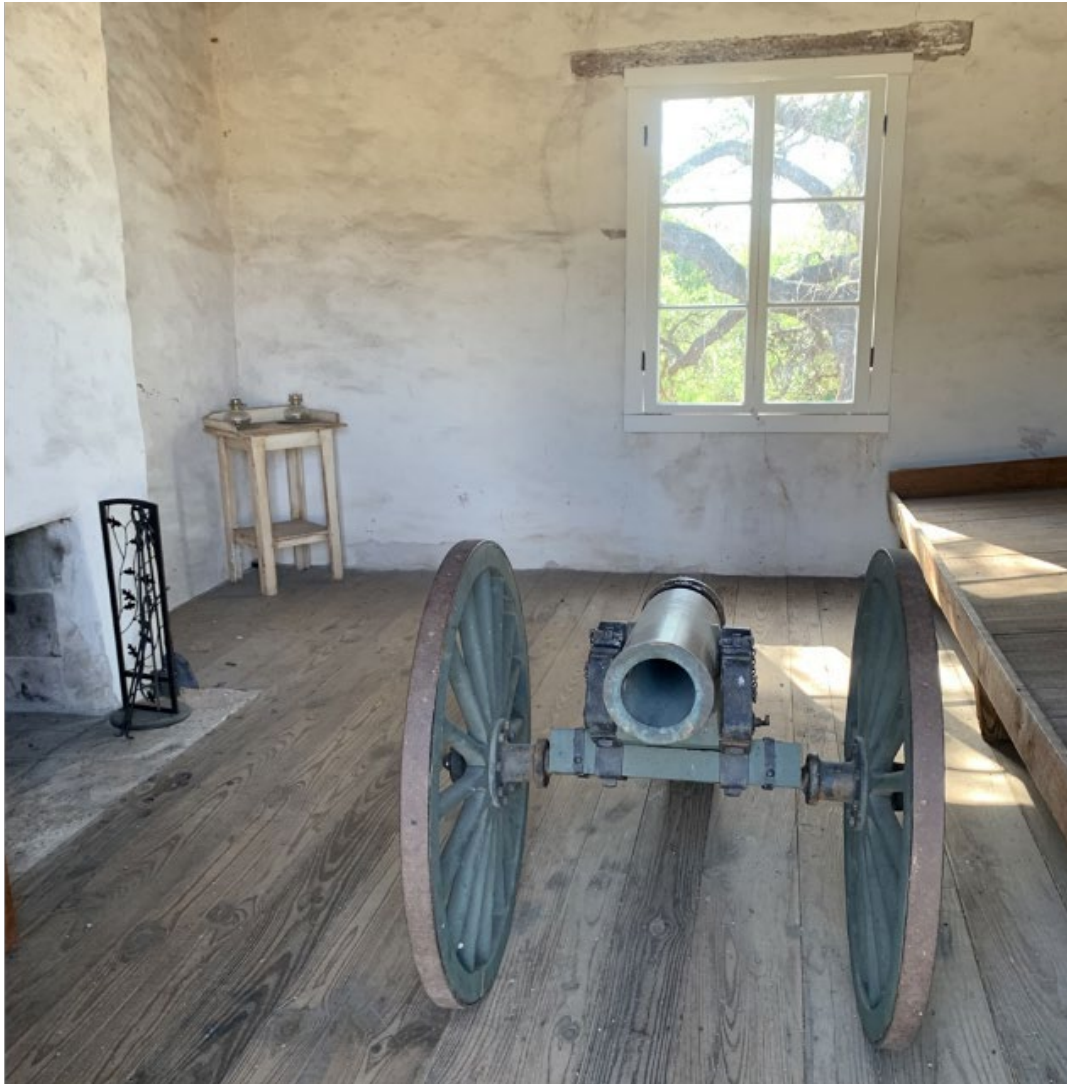
Figure 2. M1841 Mountain Howitzer