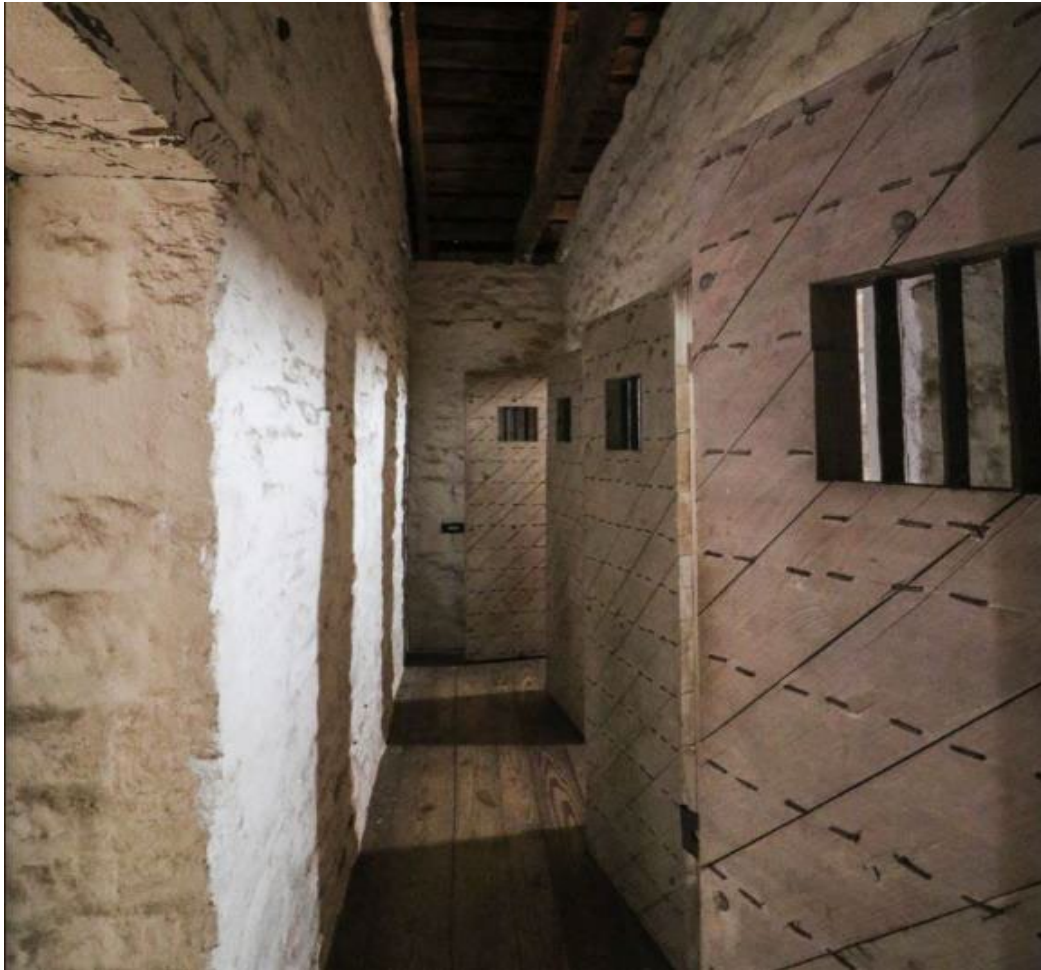
Figure 4. Jail Cells Located in Guardhouse