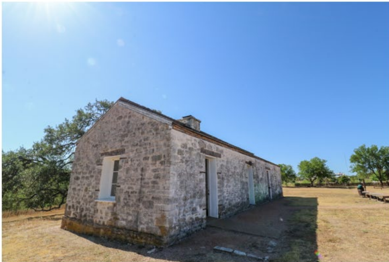
The Guardhouse is the only remaining original structure of the site