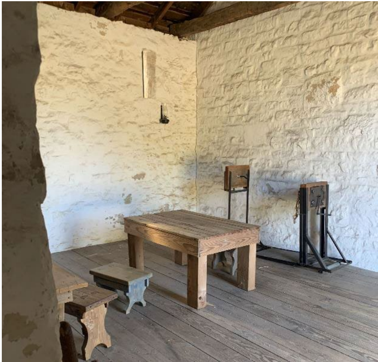
Figure 3. Room Two Guardhouse