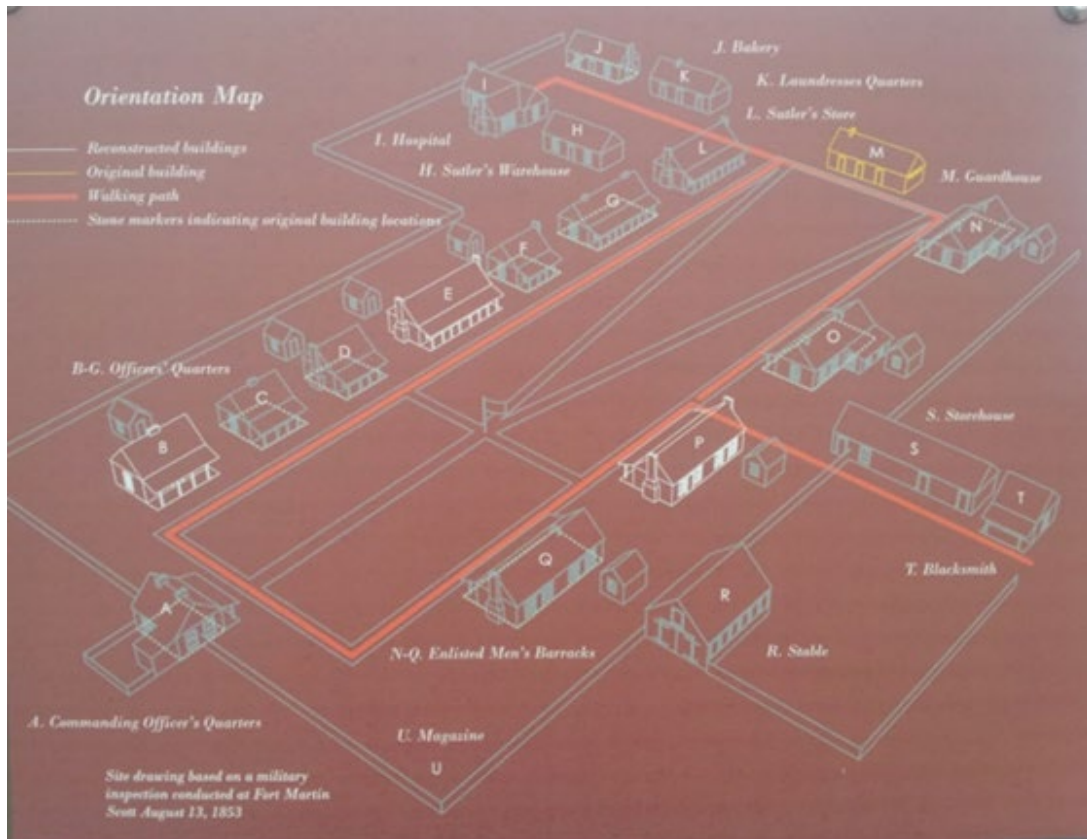
Figure 1. Drawing based on a military inspection conducted at Fort Martin Scott, August 13, 1853