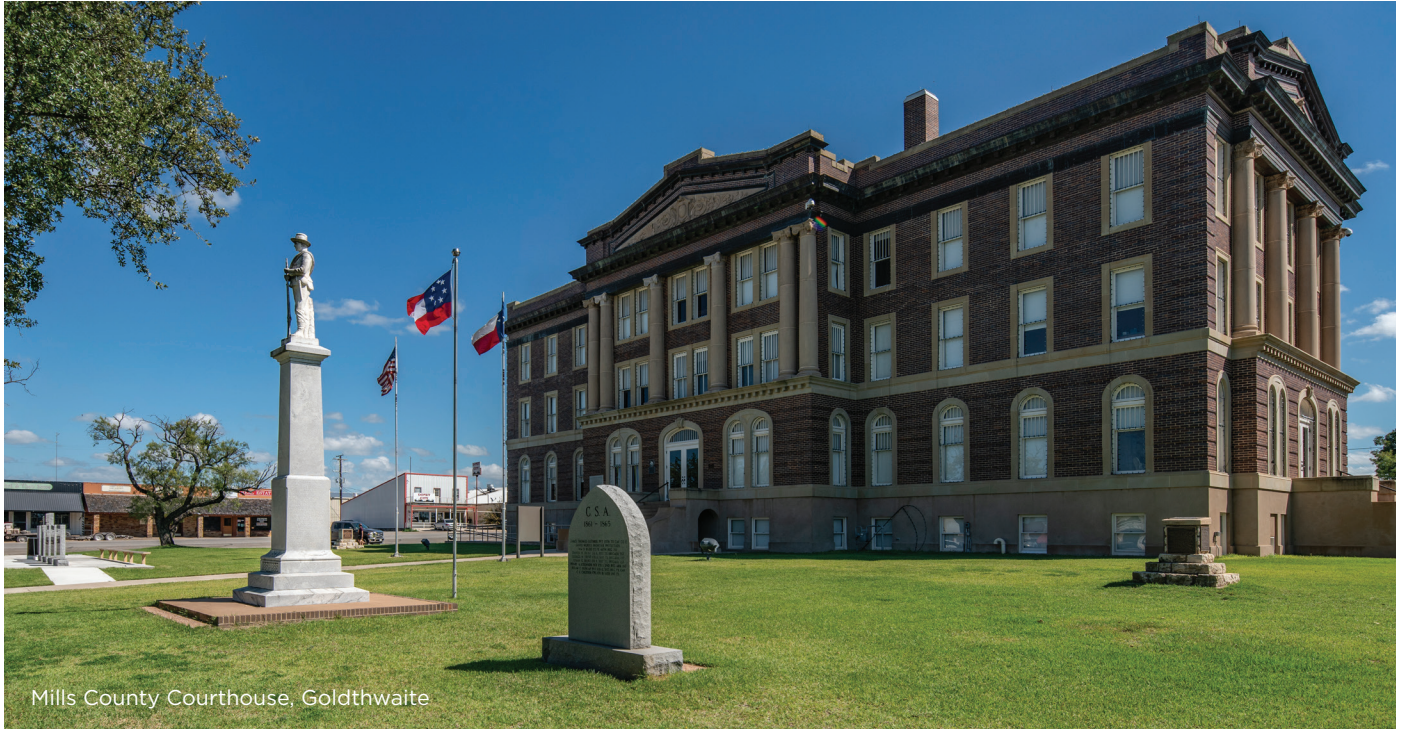
Mills County Courthouse, Goldthwaite

Since 1999, the Texas Historic Courthouse Preservation Program (THCPP), and its local partners have made significant financial investments in the restoration of historic courthouses across the state.