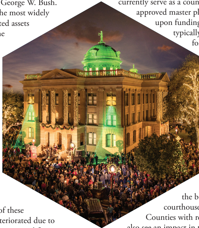
Above: Williamson County Courthouse, Georgetown

Counties with restored historic courthouses also see an impact in the form of improved building accessibility and usability, easier building maintenance, increased safety and energy efficiency, and downtown revitalization in addition to expanding local tourism.