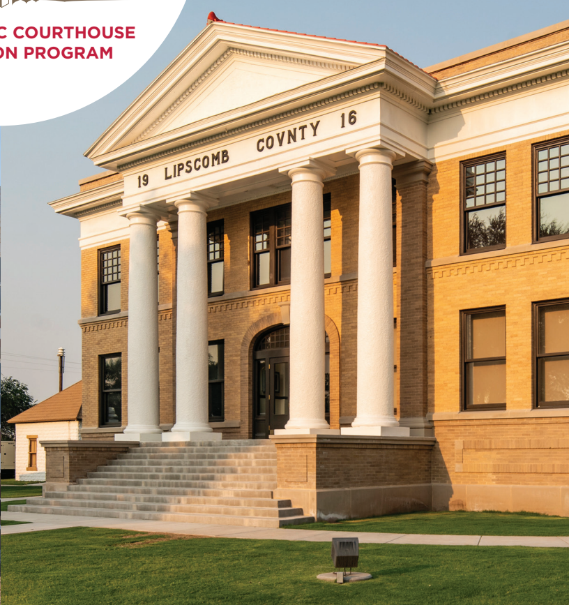
Clockwise from top left: Falls, Marion, Lipscomb, and San Saba County Courhouses