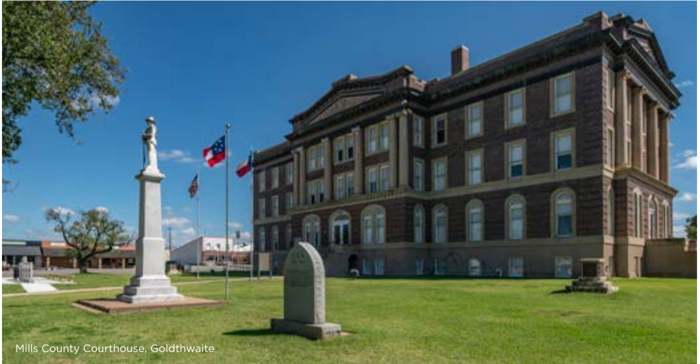
Mills County Courthouse, Goldthwaite

Since 1999, the Texas Historic Courthouse Preservation Program (THCPP), and its local partners have made significant financial investments in the restoration of historic courthouses across the state.