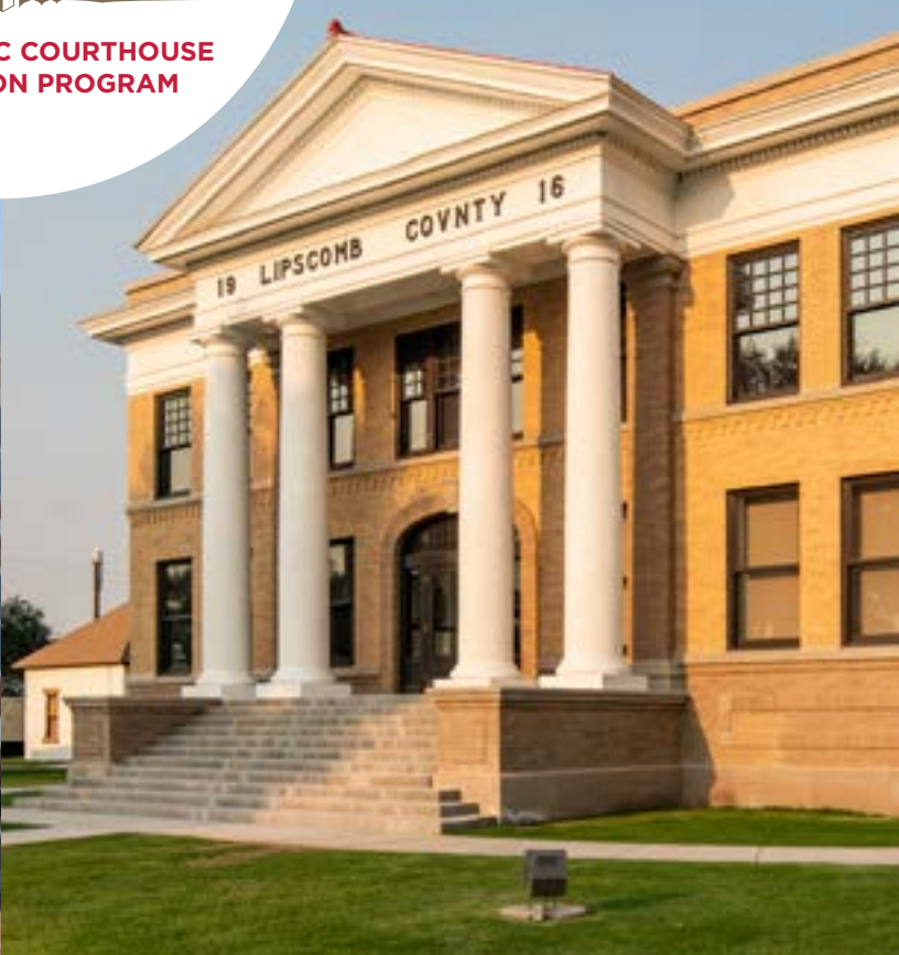
Clockwise from top left: Falls, Marion, Lipscomb, and San Saba County Courhouses