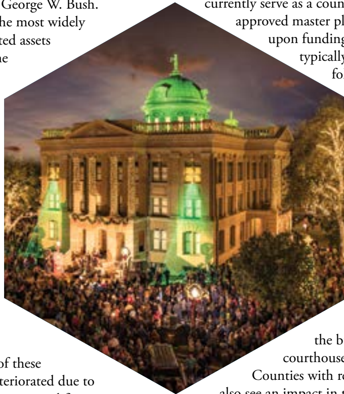
Above: Williamson County Courthouse, Georgetown

Counties with restored historic courthouses also see an impact in the form of improved building accessibility and usability, easier building maintenance, increased safety and energy efficiency, and downtown revitalization in addition to expanding local tourism.