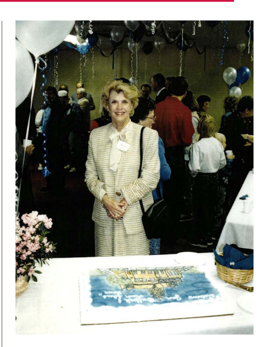
A 35th anniversary issue of Main Street Matters would not be complete without honoring our founder the late Anice Read, a visionary who laid a strong foundation for the Texas Main Street Program.

During fiscal year 2015 (ended August 31, 2015), the Texas Main Street Program staff conducted 161 site visits and spent almost 6,000 hours on specific projects requested by local Main Street programs. These projects range from design renderings and reports to planning documents for both city planning and organizational management / program development purposes, plus analytical/financing reports. Design staff was directly involved