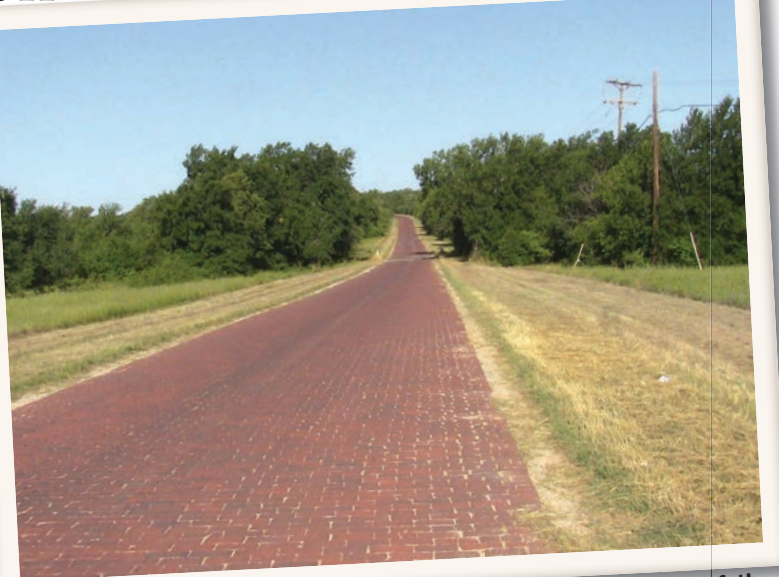
The original red brick pavers remain on this original stretch of the Bankhead Highway outside Cisco in Eastland County. Photo courtesy of the Texas Historical Commission.

parallels Interstates 20 and 30 today. The interstates replaced some sections of the Bankhead and bypassed it in other areas.