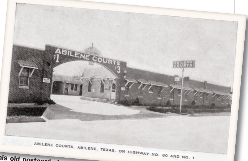
This old postcard shows the 1930 Abilene Courts, a motor court that provided accommodation to Bankhead Highway auto trekkers stopping overnight in Abilene, Taylor County.