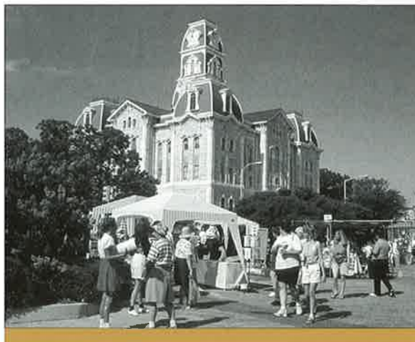
Peach Festival at the Parker County Courthouse in Weatherford.