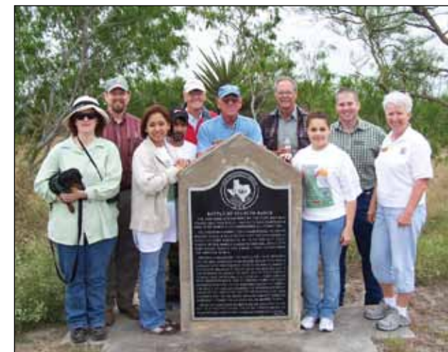
Above: Park Day at Palmito Ranch Battlefield NHL April 4, 2008

Palmito Ranch Battlefield lies within a barren stretch of coastal plain, approximately midway between Brazos Island, a Union Army post during the war, and Fort Brown, the Confederate headquarters in Brownsville. The battlefield’s strategic position in the vicinity of the mouth of the Rio Grande along the Texas-Mexico border was no accident. During the war, the South’s only international boundary was critical to the Confederacy’s