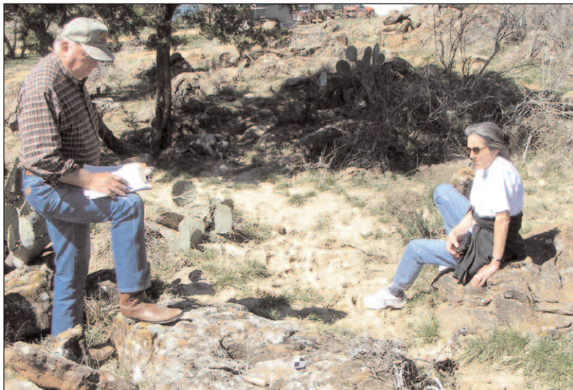
A Texas Historical Commission archeological steward (left) records a prehistoric site for a Palo Pinto County landowner (right).

There are currently about 65,000 known archeological sites in Texas, and many times more that number remain unknown and undiscovered. Some of these sites date back at least 13,000 years, while others are just a century old or less. Texas has a wealth of such historic places, from ancient Ice Age hunting camps to military sites from World War II — and everything in between. Together, these sites contain artifacts left behind by more than 500 generations of Texans. They are historically and scientifically important to our state because they contain the actual remains of our deep and eventful history.