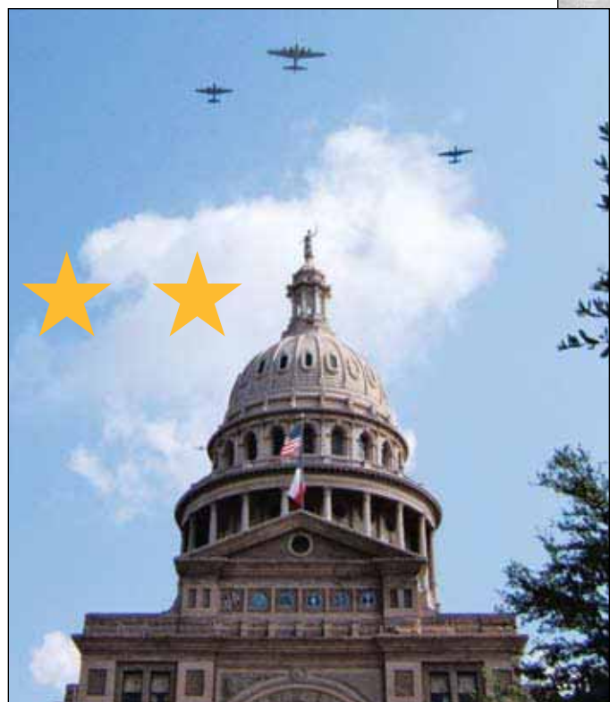
Vintage military aircraft fly over the Texas State Capitol to celebrate the launch of the THC's World War II initiative on September 2, 2005.