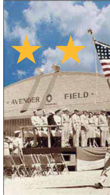
Right: Avenger Field in Sweetwater. Below: Women pilots.