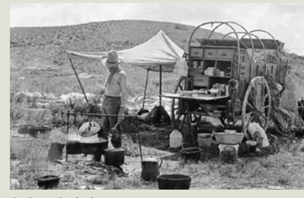
Cowboy and a chuckwagon.

"chuck" food box with drawers to the back, and installing a canvas underneath for supplies.