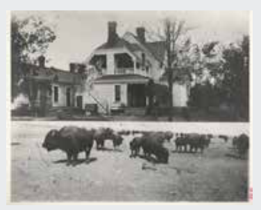
Buffalo Herd at Goodnight Ranch

The Goodnight ranch became the Goodnight American Buffalo Park and was open to the public. As a tourist attraction, visitors could picnic and gather at the ranch on Sundays and purchase bison meat that was shipped around