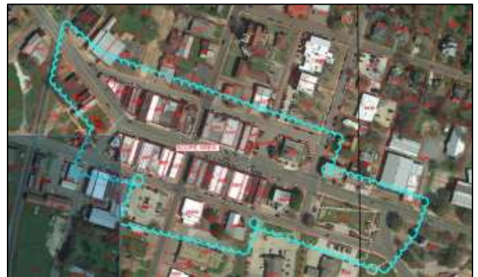
The full scope area for downtown Pittsburg's public improvement plan. Phase 1 started in 2020 with sidewalk improvements.

About $98 million , or just under 38% of the total, came from the public sector . Many of the projects assumably had been in planning stages or underway prior to COVID's arrival but were continued in 2020. This includes Taylor's phased traffic calming along 2 nd and Main, phase 1 of a larger improvement project in Pittsburg ; a $700,000 TxDOT signal project in downtown Seguin ; and a Wifi/security project in the Waxahachie Main Street district.