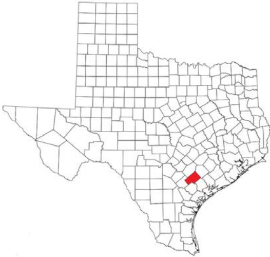
Map 2: Google Earth, accessed March 1, 2018