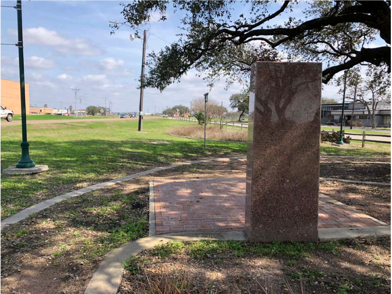
Photo 6: DeWitt County Monument back elevation—camera facing east, February 16, 2018. The monument was historically part of a landscape design plan implemented by the Texas Highway Department for roadside parks. Until 2012, a turnout between the highway junctions ran in front of the nominated property.

DeWitt County Monument, Cuero, DeWitt County, Texas