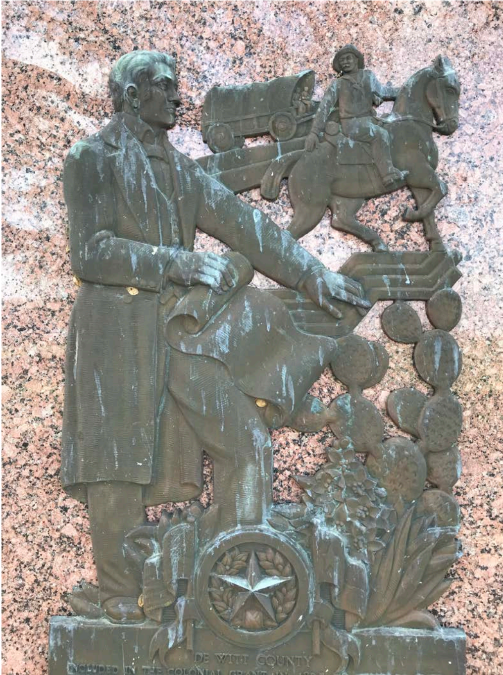
Photo 3: DeWitt County Monument bas-relief detail—camera facing west, February 16, 2018. The Raoul Josset-designed bas-relief depicts empresario Green DeWitt ushering Anglo colonists to the county.

DeWitt County Monument, Cuero, DeWitt County, Texas