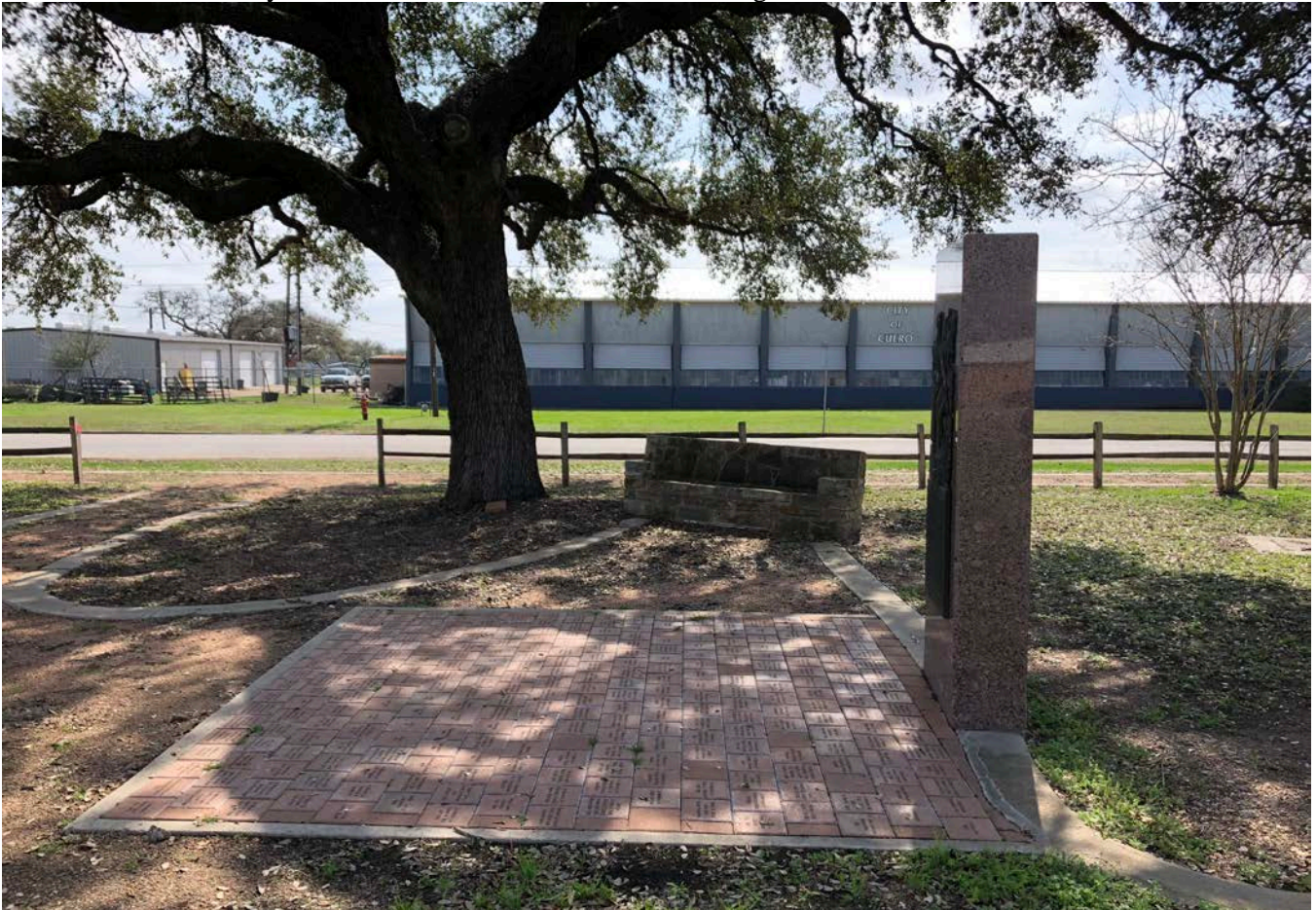
Photo 5: DeWitt County Monument side elevation—camera facing south, February 16, 2018.

DeWitt County Monument, Cuero, DeWitt County, Texas