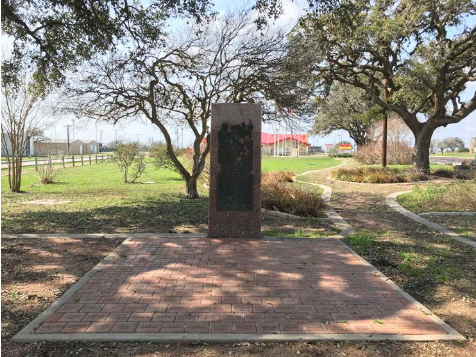
Photo 2: DeWitt County Monument—camera facing west, February 16, 2018.