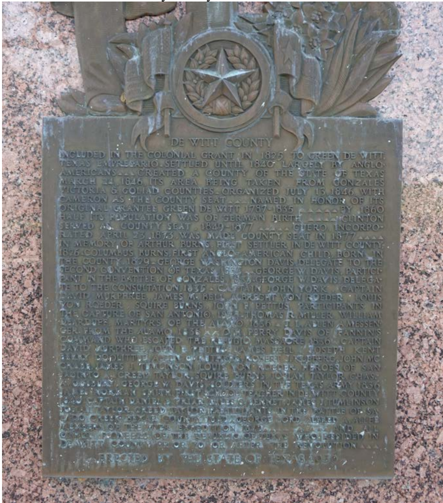
Photo 4: DeWitt County Monument plaque detail—camera facing west, February 16, 2018. The monument marker text outlines county history.

DeWitt County Monument, Cuero, DeWitt County, Texas