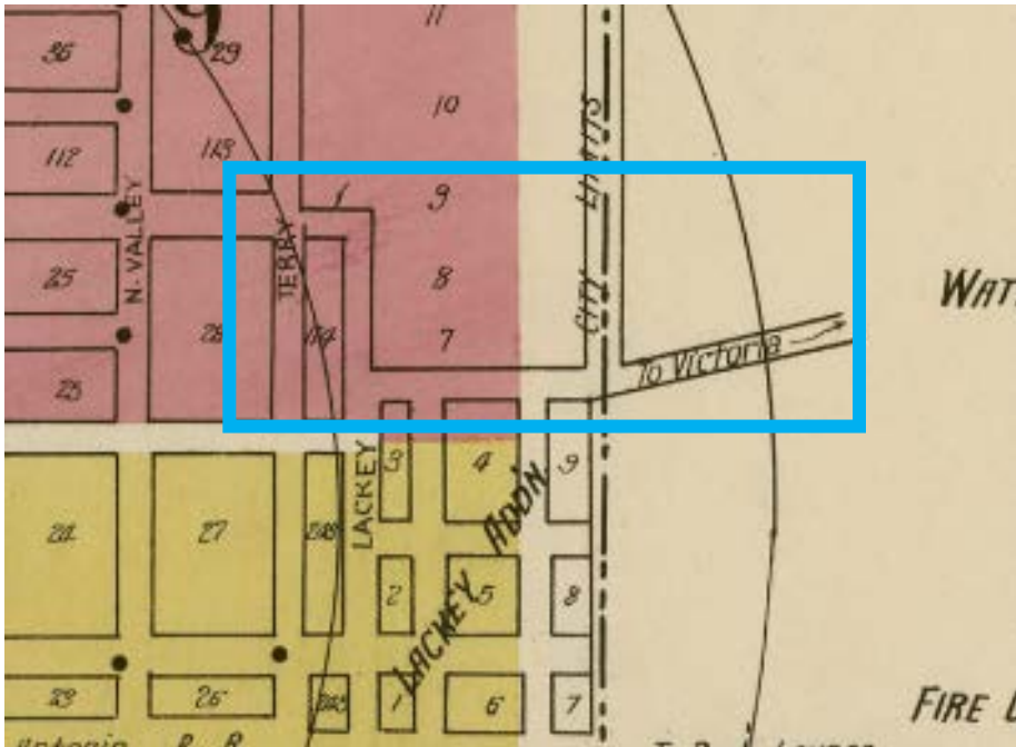
Figure 2: Sanborn Fire Insurance Map, 1950. The later map of the same area shows the 1931 highway junction (within the blue box) that created the triangular parcel where the nominated monument (star) is located.