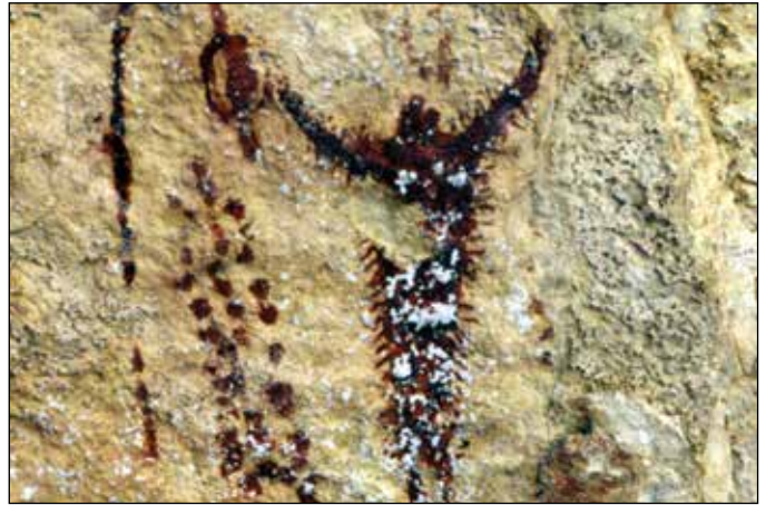
Panther Cave pictograph.

The Archeological Atlas is a database of more than 80,000 archeological sites in Texas. Available only to qualified researchers, it allows users to easily retrieve information about historic Texas sites.