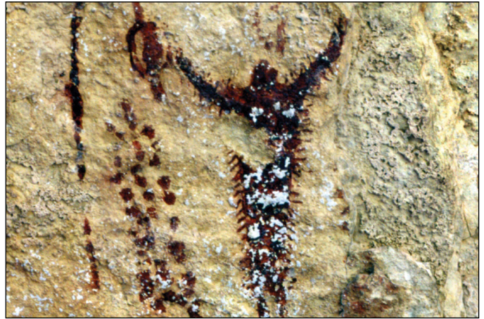
Panther Cave pictograph.

The Archeological Atlas is a database of more than 80,000 archeological sites in Texas. Available only to qualified researchers, it allows users to easily retrieve information about historic Texas sites.