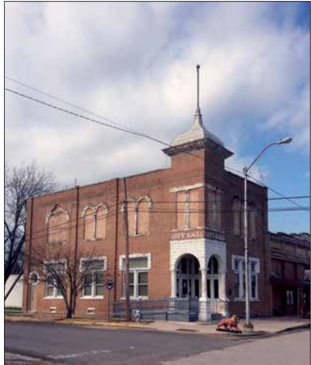
Granger City Hall, a Recorded Texas Historic Landmark, received a FY 2015 Texas Preservation Trust Fund planning grant for structural stabilization.

The division oversees the care and maintenance of the THC buildings, which include an antebellum home, an 1880s church, and a 1940s apartment house. Staff prepares architectural plans and specifications for rehabilitation projects related to the structures.