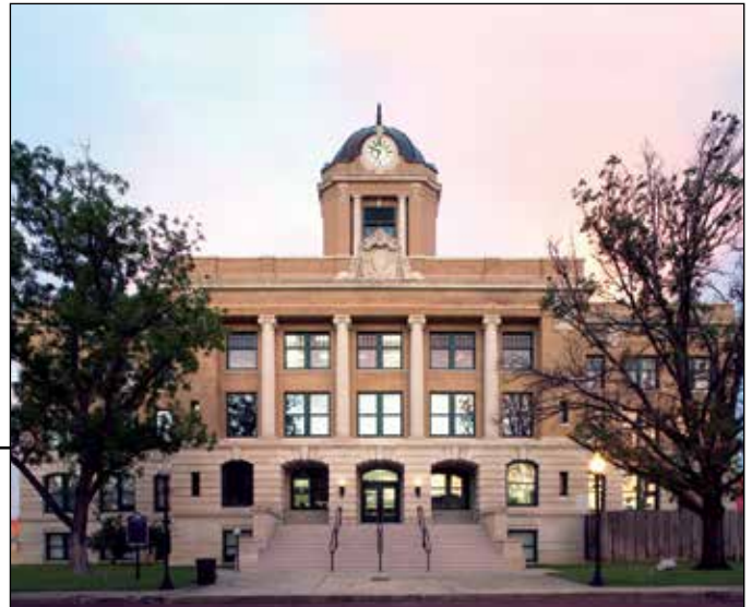
The 1912 Cooke County Courthouse was rededicated in 2011.

The Texas Historic Courthouse Preservation Program, and its local partners have made significant financial investments to restore many valuable historic courthouses throughout the state. In order to protect and preserve these buildings for future generations, the Texas Courthouse Stewardship Program was created in 2005 to assist counties by fostering facility planning, budgeting, and training. The goal is to prevent the facilities from returning to a state of deferred maintenance and disrepair. Specific program activities include site visits and easement monitoring, training workshops, maintenance planning, and technical consultations.