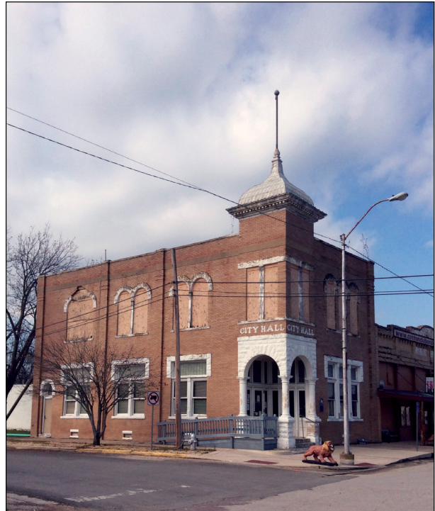
Granger City Hall, a Recorded Texas Historic Landmark, received a FY 2015 Texas Preservation Trust Fund planning grant for structural stabilization.

The THC has administered over 35 subgrants for projects ranging from surveys to rehabilitation, preservation planning, and educational efforts. All projects must be concluded and reimbursed by March 31, 2024, the end date of the grant.