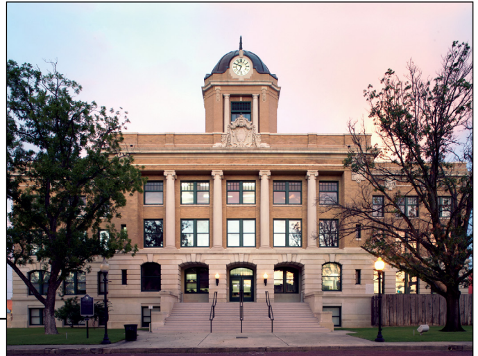
The 1912 Cooke County Courthouse was rededicated in 2011.

The Texas Historical Commission's (THC) Division of Architecture works to preserve and protect Texas' diverse architectural heritage. Staff members provide design and rehabilitation advice to assist with preserving properties that span the state's rich history, from majestic historic county courthouses and commercial buildings to Spanish missions and log cabins.