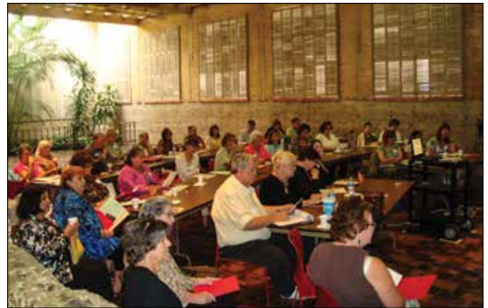
CHC Outreach staff develop CHC educational workshops. Above training was held at the King Ranch Museum.

County Historical Commissions (CHCs) are appointed by county government to preserve local historic resources. The Texas Historical Commission (THC) created the CHC Outreach Program in 2008 to support these unpaid appointees who play a vital role in our efforts to save the real places that tell the real stories of Texas. Currently, there are more than 200 CHCs, made up of 3,500 appointees who donate more than 450,000 hours of service each year.