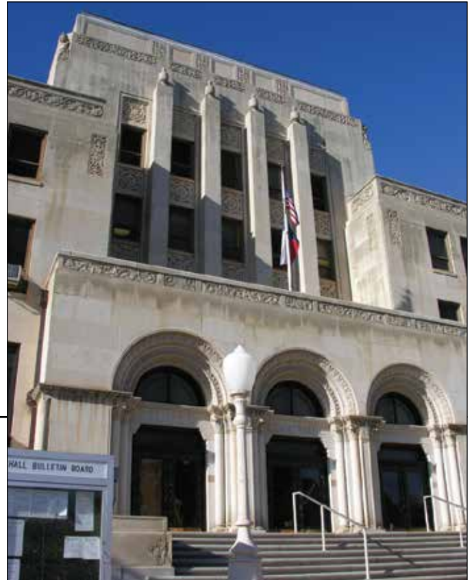
City Hall Building in San Angelo, an active CLG community since 1994.

Projects eligible for grant funding may include architectural, historical, and archeological surveys; oral histories; nominations to the National Register of Historic Places; staff work for historic preservation commissions; design guidelines and preservation plans; educational and public outreach materials such as publications, videos, exhibits, and brochures; training for commission members and staff; and rehabilitation or restoration of National Register-listed properties.