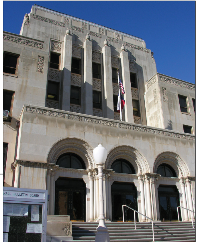
City Hall Building in San Angelo, an active CLG community since 1994.

Projects eligible for grant funding may include architectural, historical, and archeological surveys; oral histories; nominations to the National Register of Historic Places; staff work for historic preservation commissions; design guidelines and preservation plans; educational and public outreach materials such as publications, videos, exhibits, and brochures; training for commission members and staff; and rehabilitation or restoration of National Register-listed properties.