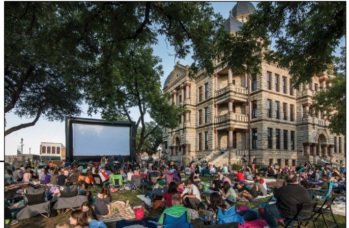
Locals gather on the courthouse lawn for a movie night in Denton, a Main Street city since 1990.

The Texas Main Street Program maintains DowntownTX.org , a real estate and building inventory tool that lists commercial buildings in historic downtowns. It links investors and developers to properties that are potentially eligible for historic preservation tax incentives.