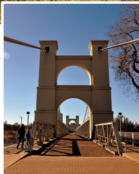
Official State of Texas Longhorn Herd at Fort Griffin State Historic Site, near Albany (above top). Waco Suspension Bridge (above).