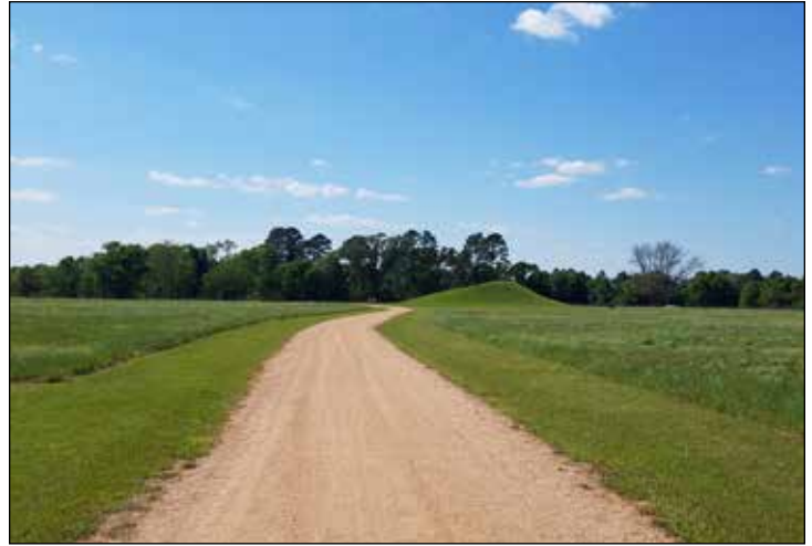
Caddo Mounds State Historic Site, Alto.