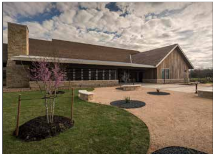
Top: Fulton Mansion State Historic Site, Rockport. Bottom: San Felipe de Austin State Historic Site Museum.

Site following Hurricane Harvey, construction of the museum and visitors center at San Felipe de Austin State Historic Site, the Red River War Battle Sites Project, the Preservation Scholars Program, the Texas Courthouse Stewardship Program, THC's annual Real Places Conference, and many other initiatives.