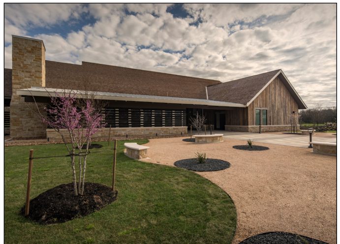
Top: Fulton Mansion State Historic Site, Rockport. Bottom: San Felipe de Austin State Historic Site Visitor Center.

River War Battle Sites Project, the Preservation Scholars Program, the Texas Courthouse Stewardship Program, the THC's annual Real Places conference, and many other initiatives.