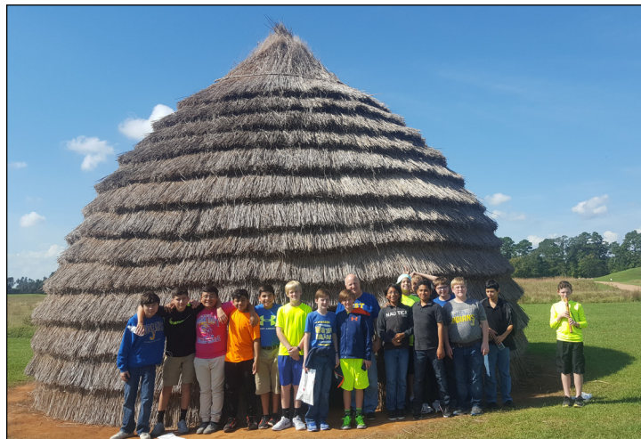
Caddo Mounds State Historic Site, Alto.