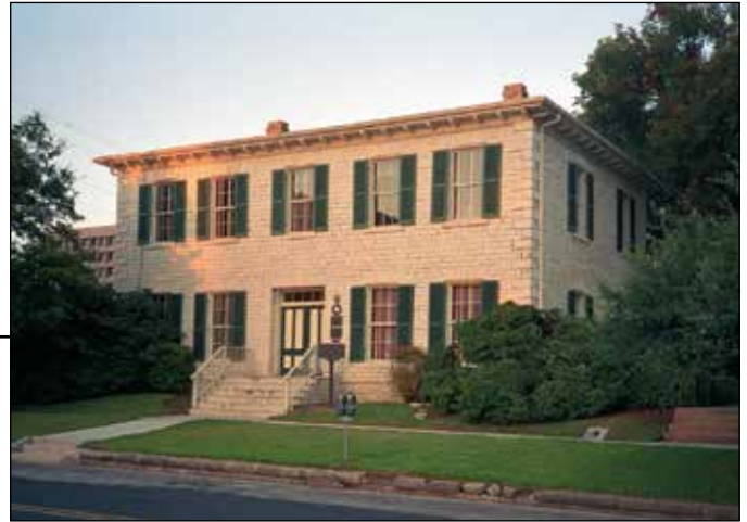
THC's Carrington-Covert House, downtown Austin

The THC is composed of 15 citizen members appointed by the governor to staggered six-year terms. The agency employs more than 200 people who work in various fields, including archeology, architecture, history, economic development, heritage tourism, public administration, and urban planning.