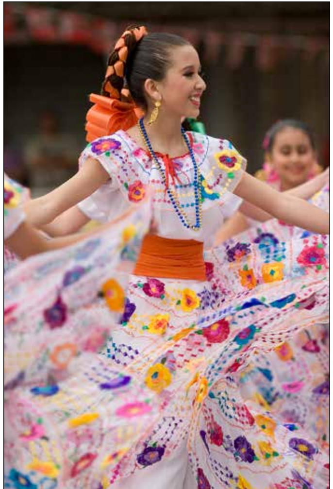
Folklorico dancers, Corpus Christi festival

Please mail application, resume, and transcript to the above specified address or deliver them in person at 1700 N. Congress Avenue, Suite B-65 in Austin. Cover letters can be attached, but are not required. Resumes cannot be submitted in lieu of applications. Applications will be reviewed, and top applicants will be contacted for interviews. After a qualified person has been chosen for the specified internship, letters will be mailed to all interviewed applicants letting them know that the position has been filled. Disability access for application