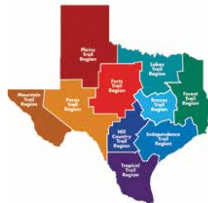
Shown above: Located near Clifton in Cranfills Gap, The Old Rock Church, part of the Norse Historic District, was built in 1886 by Norwegians who utilize it today for special services. Inset: Texas Heritage Trail Regions.