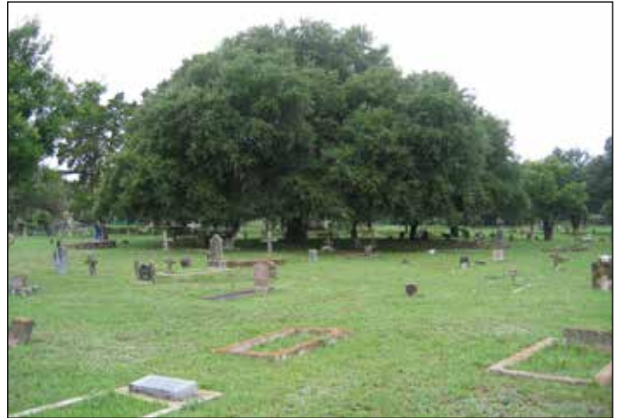
Travis County cemetery, designated August 2000.

Cemeteries are important keys to Texas' past. They are reminders of settlement patterns and reveal information about historic events, religion, lifestyles, and genealogy. Unfortunately, historic cemeteries are increasingly threatened by development pressures, encroachment, vandalism, and theft. Circumstances can change quickly—a cemetery considered maintained and safe can become neglected and endangered. To address the problem of cemetery destruction and to record as many cemeteries as possible, the Texas Historical Commission oversees the Historic Texas Cemetery (HTC) designation.