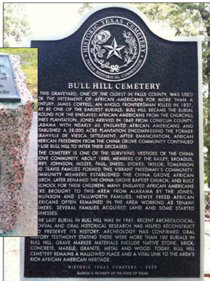
Left: Aransas County centennial marker. Right: Bull Hill Cemetery marker in Falls County.