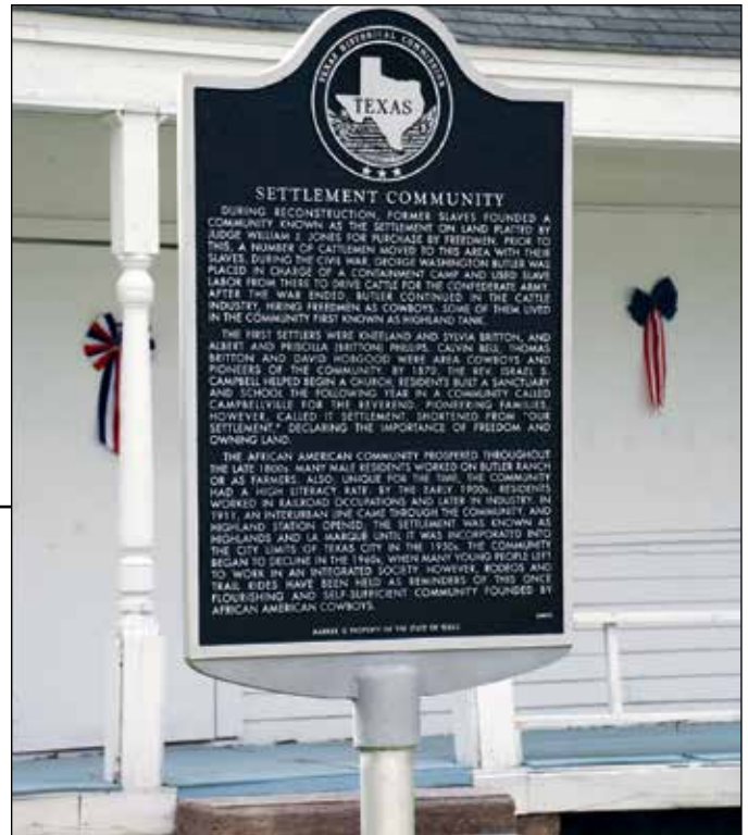
Settlement Community marker in Galveston County.

Age, significance, and architectural requirements govern the eligibility of topics and sites when applying for a subject marker, Historic Texas Cemetery marker, or a Recorded Texas Historic Landmark marker. Applications must be submitted to the CHC for review and approval. Each new and replacement historical marker includes a $100 application fee that funds special markers to address historical gaps, promote diversity of topics, and proactively document untold stories of our state.