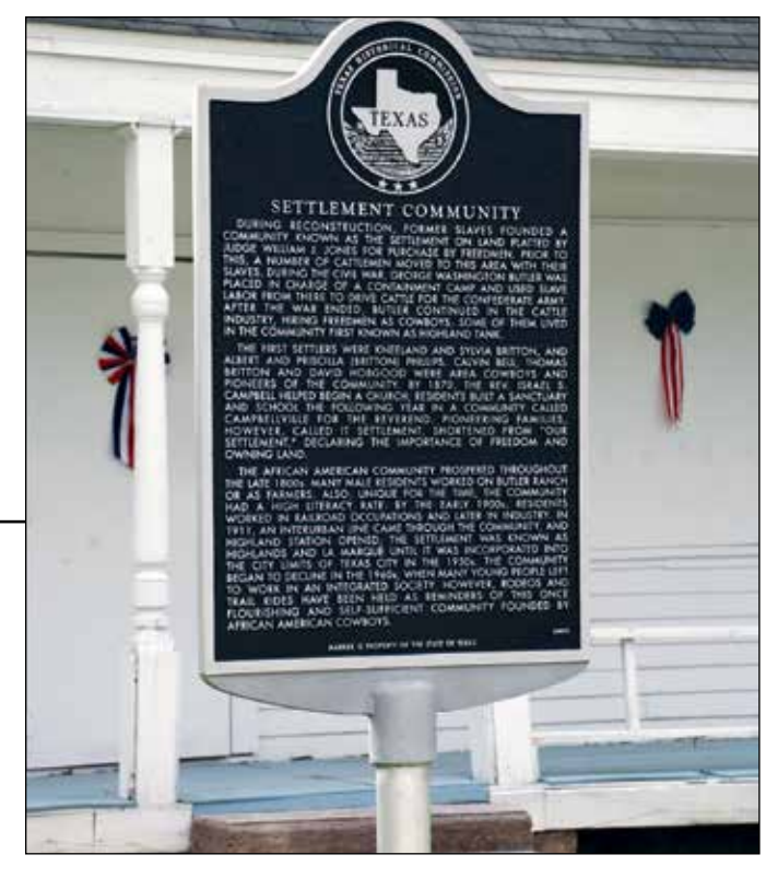
Settlement Community marker in Galveston County.

Age, significance, and architectural requirements govern the eligibility of topics and sites when applying for a subject marker, Historic Texas Cemetery marker, or a Recorded Texas Historic Landmark marker. Applications must be submitted to the CHC for review and approval. Each new and replacement historical marker includes a $100 application fee that funds special markers to address historical gaps, promote diversity of topics, and proactively document undertold stories of our state.