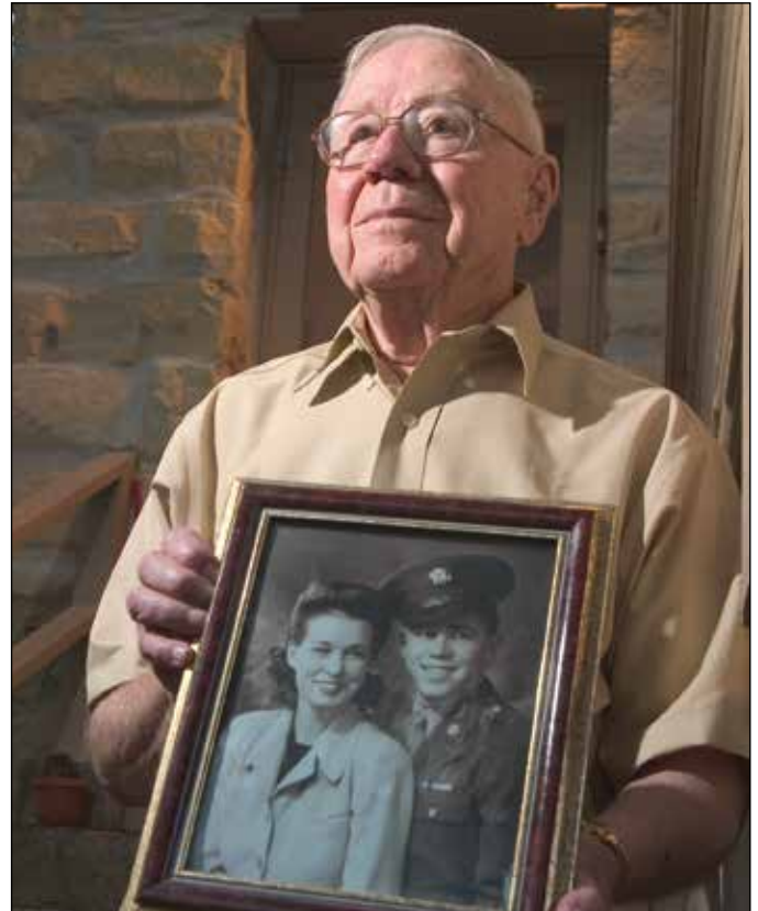
Oral histories enhance our understanding of the past by illuminating personal experience.

The Military Sites Program documents, commemorates, preserves, and promotes historic sites where Texas military personnel served, both inside and outside the state. Projects include surveying sites in Texas associated with both military and home front activities. Popular heritage tourism brochures produced through this program include Texas in the Civil War and Texas in World War II, which are available for download on the agency's website. The agency's Texas in the Cold War initiative offers oral history training workshops to assist in documenting Texas Cold War veterans' stories and accomplishments.