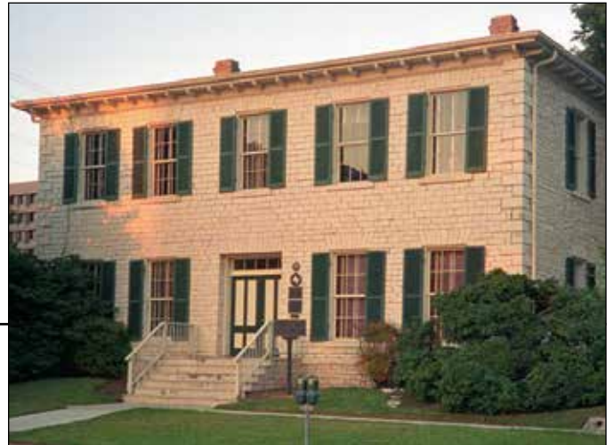
The THC headquarters is located in the historic Carrington-Covert House in downtown Austin.