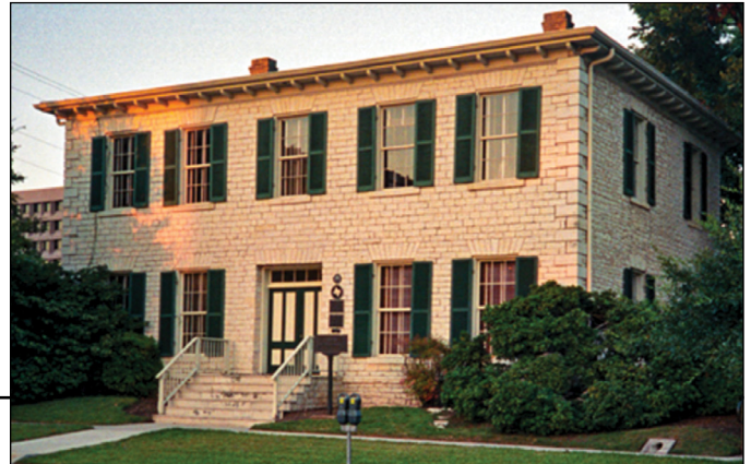
The THC headquarters is located in the historic Carrington-Covert House in downtown Austin.

The Texas Historical Commission (THC) works to save the real places that tell the real stories of Texas. Staff consults with citizens and organizations to preserve Texas' architectural, archeological, and cultural landmarks. The agency is recognized nationally for its preservation programs.