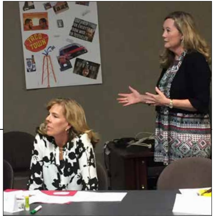
Museum staff participate in a workshop on understanding audiences.