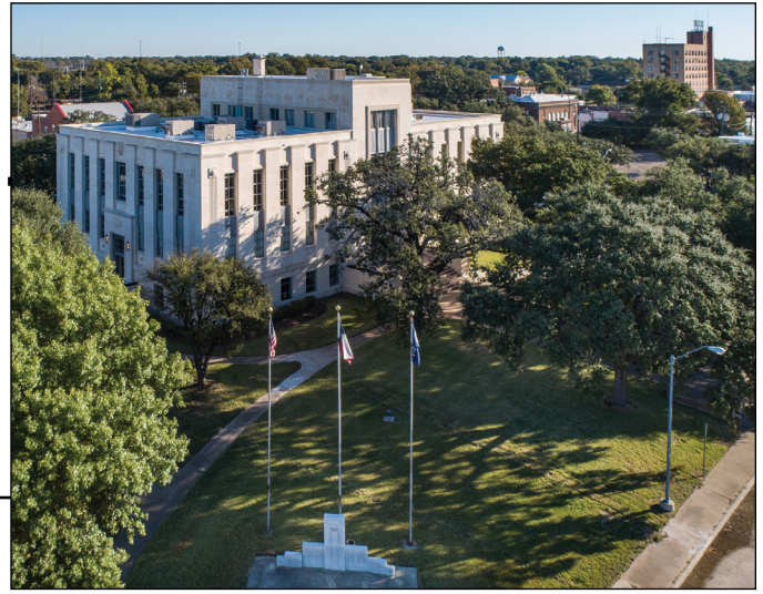
1939 Falls County Courthouse.

PROJECT EXAMPLE: With its CLG grant, Abilene developed a comprehensive strategic plan to direct preservation activities.