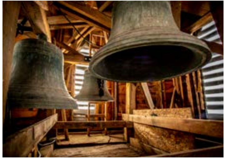
San Agustín Cathedral clock tower and interior views of bells in Laredo, Webb County.