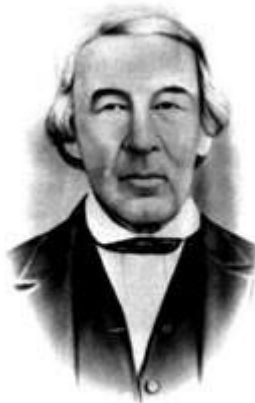
José Antonio Navarro

The scholarship recipient who embodies the spirit, character, and potential that most resembles José Antonio Navarro, will have good academic standing, leadership qualities, and will demonstrate an awareness of needs and issues within his/her community.