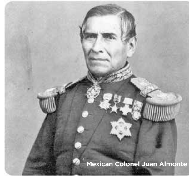
Mexican Colonel Juan Almonte

6. Sherman's Advance: Left Wing of Infantry, April 21, 1836. The Second Regiment fired the first shots on the 21st. Sherman and his men encountered Mexican troops near the marsh as they approached the Mexican camp and opened fire. Many of Sherman's soldiers only had time to fire once before they reached the Mexican camp.