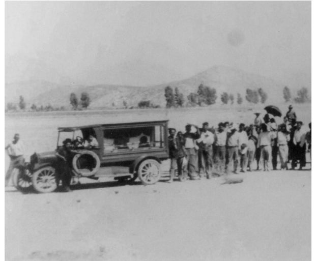
Photo: A funeral procession arranged by the business that would later become Flores Funeral Home. Date unknown..