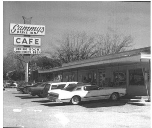
Photo: The exterior of Sammy's Restaurant in Donna. Date unknown.