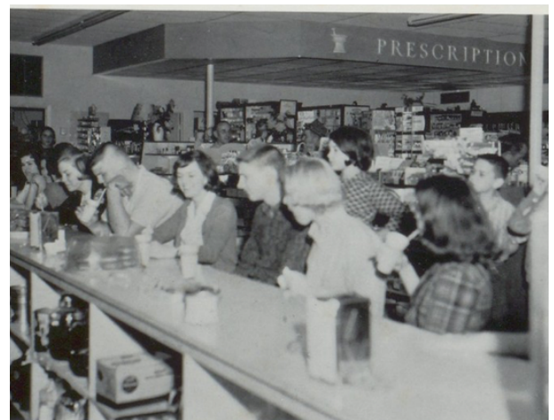
Photo: From the 1965 Anahuac High School yearbook, "Teens at soda fountain," featuring Wilcox Drug Store.