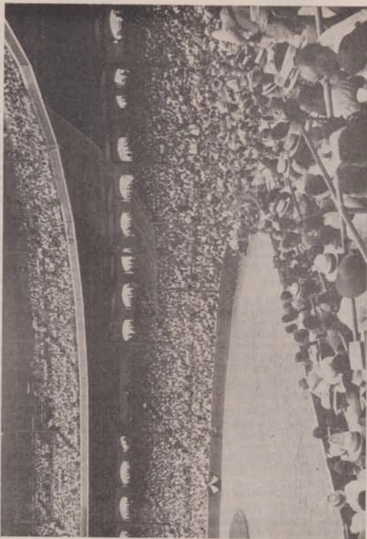
Comisky Park, home of the East-West Baseball classic. It originated here and has been a great spot and social event since 1923. More than 600,000 spectators have seen Jackie Robinson, Roy Campanella, Satchel Paige, Larry Doby, "Mud" Sutcliffe, "Buck" Leonard and other stars too numerous to mention during the thrilling games that have been played.

Admission Free on Wednesday, Saturday and Sunday. Admission 25c on other days. Children Free mornings. Take any south bound car on Wabash except cars marked Wabash-Harrison, or any south bound car on State St. or south bound car on Clark St., except those marked Clark-Downtown and transfer east on Roosevelt Road to terminal