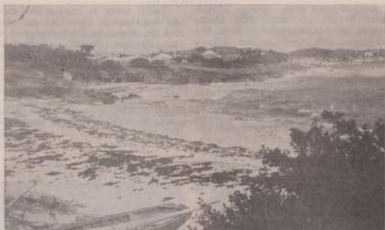
John Smith's Bay, Bermuda