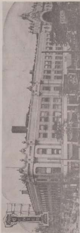
Forty-seventh and South Parkway, the "hub" of an area of 150,000 Negroes, includes the first where all "Bronxville" must receive or leave their jobs. The large South Center building, the South Center dormitory, the South Center storage, employing upward to 200 Negroes, the Regal Theatre, Savoy Ballroom, U. S. and state offices and 150 offices with highest grade professional tenants, was erected in 1928.

ord of civilization from its inception. Notable Animal exhibits — Fossils — Minerals — Meteorites. Man from all ages and every clime down to races of today. Free parking space. Admission Free Thursdays, Saturdays and Sundays. Address Roosevelt Road and the Lake. Take any South bound car on Wabash except Wabash-Harrison or take any south bound car on State St. or south bound on Clark St., except those marked Clark-Downtown and transfer east on Roosevelt Road to the terminal.