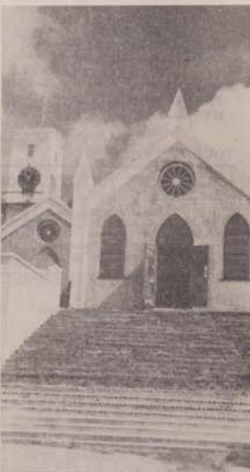
St. Peter's Church, St. Georges

You fly by the latest aircraft or you go by luxury liner. The plane takes a few hours, boats from New York, 35 hours. Departures from Baltimore, Boston, Halifax, Montreal and England. When you make reservations inquire about special rates for children.