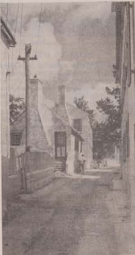
Queen Street, St. Georges, Bermuda

Mild and Equable never far off 70.7. No sudden changes occur. Rain-fall brief and skies clear very quickly after a shower.