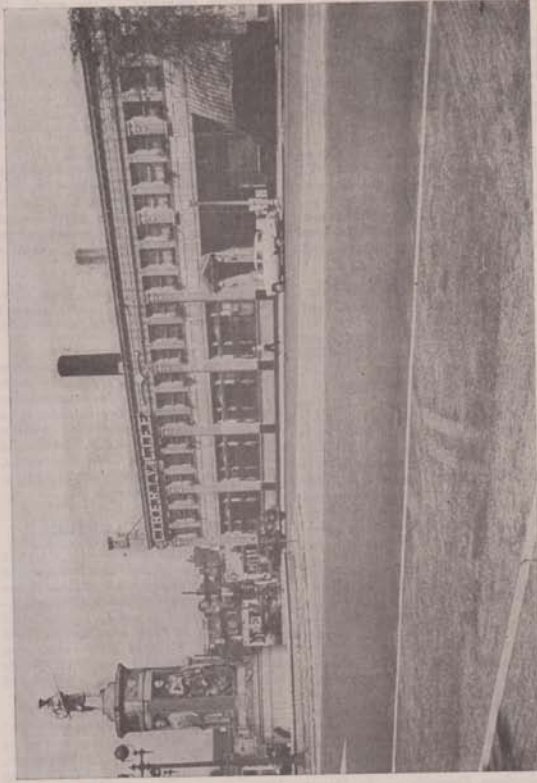
Victory, a statue erected at 35th and South Parkway by the people of the State of Illinois, in memory of the heroes of the "Old 8th" Infantry, Lincoln National Guard. In the background is the headquarters of the Supreme Liberty Life Insurance Company, third largest Negro insurance company in America. It employs 110 people in Chicago alone.