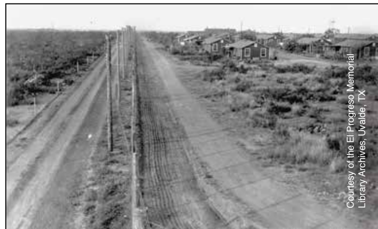
View from North West guard tower

The Crystal City Family Internment Camp closed on February 27, 1948, nearly 30 months after the end of the war—September 2, 1945. In November 1948, the Crystal City I.S.D. purchased 90 acres of the camp from the War Assets Administration, primarily within the fenced area. In 1952, the city purchased additional property to the north and east to establish an airfield. In subsequent years multiple schools were built over the former camp's footprint.