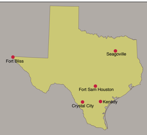
Internment Camps in Texas during World War II

Shocked by the December 7, 1941, Empire of Japan attack on Pearl Harbor, Hawaii that propelled the United States into World War II, one government response to the war was the incarceration