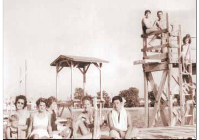
One of the three diving platforms at the camp's Swimming Pool/Irrigation Reservoir

it remains the most extant resource left of the site. The 250-foot wide circular pool was designed by Italian-Honduran civil engineer Elmo Gaetano Zannoni. With German internees providing the labor, a former swamp was drained, cleared of snakes, expanded, and paved over to form the structure.