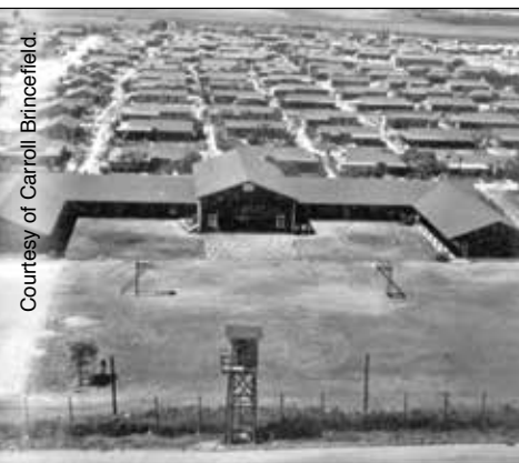
Federal High School, looking north

Below: Crystal City Family Internment Camp, looking south