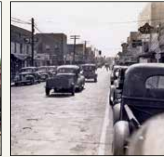
Middle right: Bankhead Highway through Mount Pleasant (Titus County) circa 1940. Right: Sinclair gas station in Albany (Shackelford County).