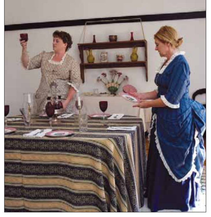
Reenactors portray the relative luxury of life on the frontier.

The field grade officers quarters (OQ #2 and OQ #3) were built in 1871. This U-shaped duplex housed the second and third officers in command of the post and their families.