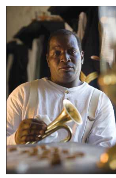
Reenactor portrays a Buffalo Soldier

Women played an important supporting role in frontier life. Officers often brought their families with them and the Army allowed one laundress to be hired for every 19 soldiers. Although their numbers were small. their influence was immeasurable. They promoted cultural activities such as dances and plays, and often the presence of just one lady on a post could lessen discipline problems.