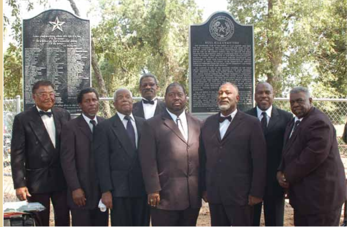
Opposite page: Members of the 62nd Expeditionary Signal Battalion of Fort Hood participated in the Bull Hill Cemetery ceremony last summer. Also taking part in the memorable event were (above) members of Marlin’s Hopeful Masonic Lodge No. 78 Prince Hall Affiliation.