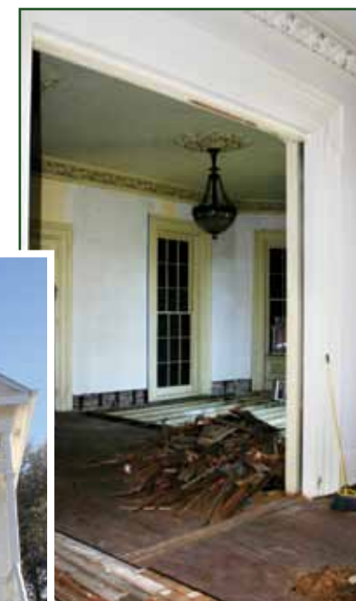
At left: The Galveston Historical Foundation's Green Revival Show House in the historic East End district is a model for sustainable residential renovation following Hurricane Ike-related damage. Above: The 1859 Ashton Villa is still undergoing storm repairs.

"The rides have picked up a bit (in 2010), but visitation is still down slightly from the pre-storm days," Gregory says. "We're just trying to make the best of it."