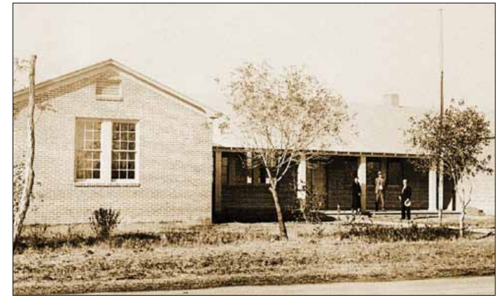
The Bee CHC has partnered with the Lott Canada Alumni and Coastal Bend College to pursue markers and designations for the Lott Canada School in Beeville, a Rosenwald school built in the 1930s. It is currently used as a school for continuing education and provides a museum space dedicated to the history of the Lott Canada School.

County Historical Commissions (CHC) are charged with developing and maintaining an inventory of surveyed properties in cooperation with the Texas Historical Commission (THC). As we enter the new year, we ask that CHCs prioritize updating their inventories to provide accurate location and condition information.