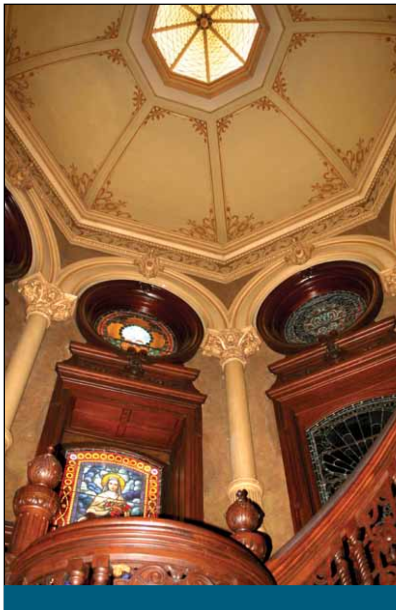
Galveston's most-visited historical attraction, Bishop's Palace, was largely unaffected by the storm.

Indeed, a glance inside the 1859 Ashton Villa residence reveals water lines on the walls, damage to a historic mirror, and a floor restoration project in one of the stately rooms. Another area of the mansion is slated for a major floor replacement project. One of the island's most notable losses was the gulfside Balinese Room, a 1940s-era nightclub