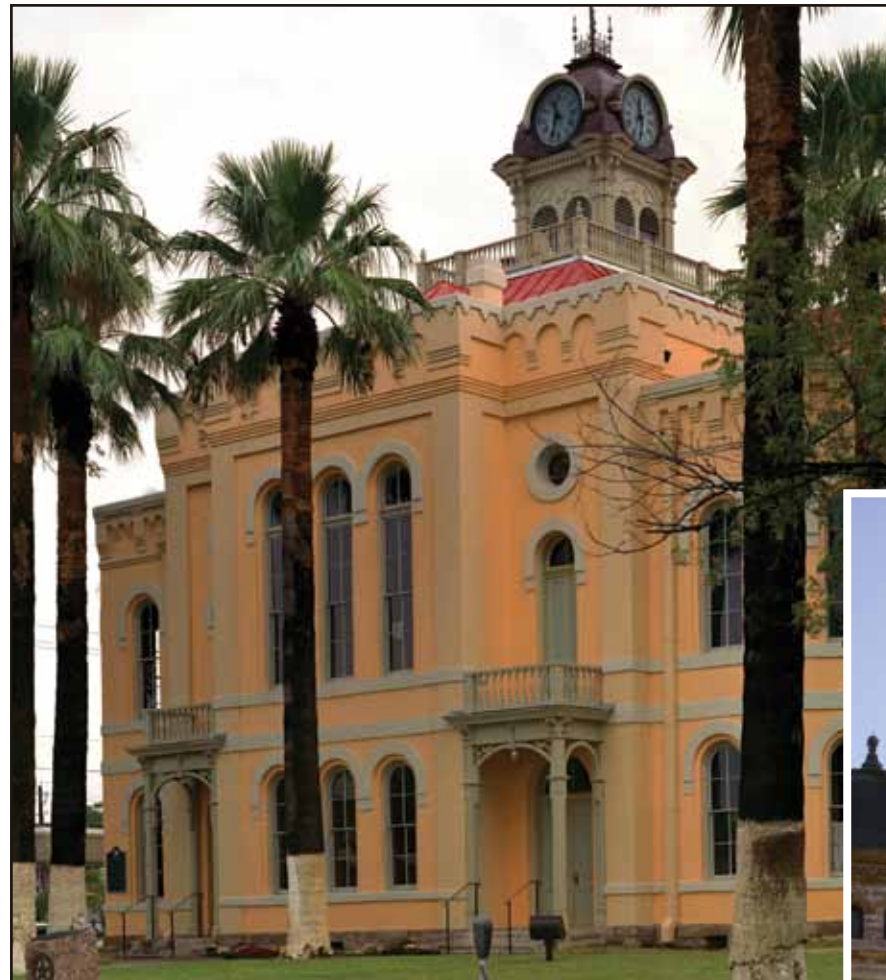
The Maverick County Courthouse in Eagle Pass (above) and Lavaca County Courthouse in Hallettsville (below) have benefited from participating in the THC's Texas Historic Courthouse Preservation Program. Both are prominent structures in their communities, drawing tenants, tourists, and related business investments to their downtown districts.

"The estimated current need to restore all remaining courthouses that have approved master plans is approximately $250 million in state funds," said Graves. "Those funds would be matched, in part, by local dollars creating jobs and stimulating adjacent businesses."