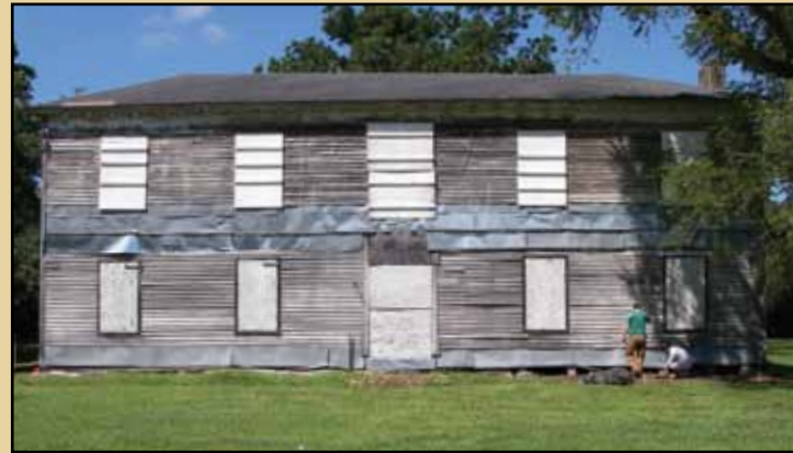
The mid-1850s main house at Levi Jordan Plantation is undergoing stabilization and is the focus of public programs at the site on the first Saturday of each month.