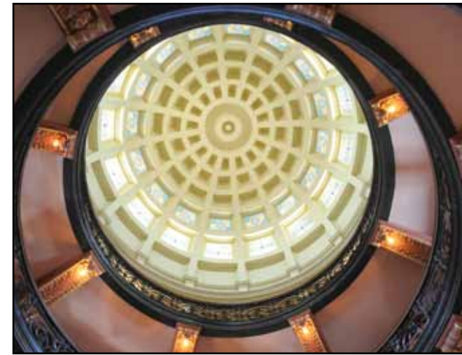
Stunning architectural detailing featured in the prominent towers of the Harrison County Courthouse in Marshall (above) and Denton County Courthouse in Denton (below) are enhanced through the Texas Historic Courthouse Preservation Program.