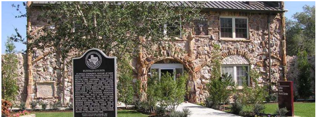
Figure 2. Historical marker commemorating a building.

Texas Historical Commission P.O. Box 12276 Austin, TX 78711-2276 512.463.6100 history@thc.state.tx.us www.thc.state.tx.us