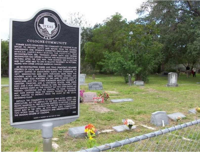
Figure 3. Historical marker commemorating a community.