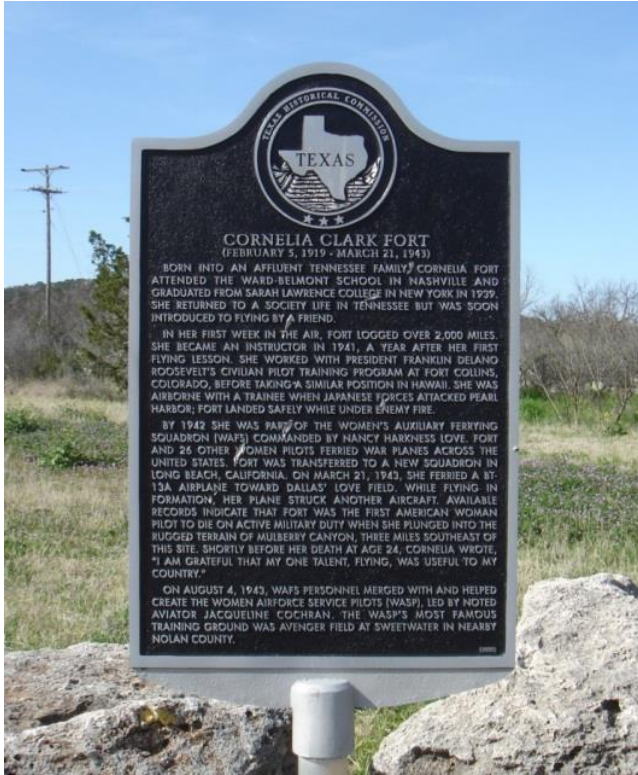
Figure 1. Historical marker commemorating a person.