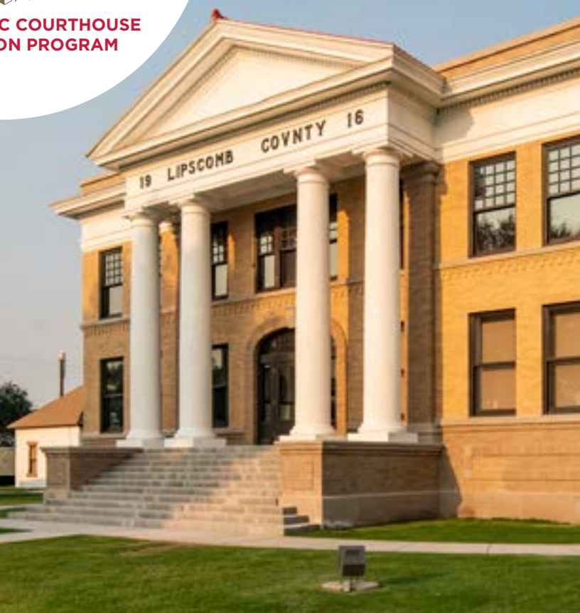
Clockwise from top left: Falls, Marion, Lipscomb, and San Saba courthouses